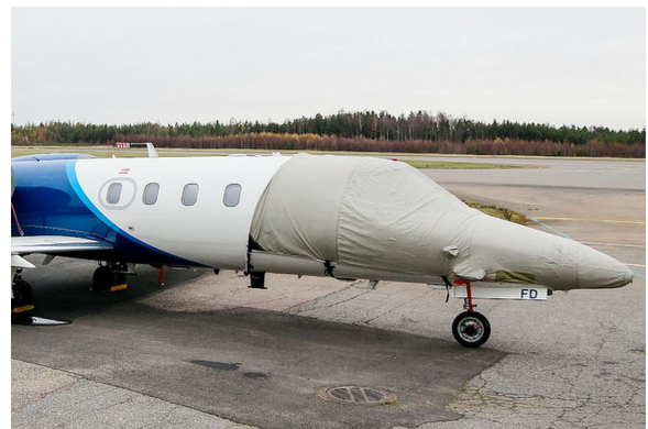
Learjet Cockpit/Nose Cover