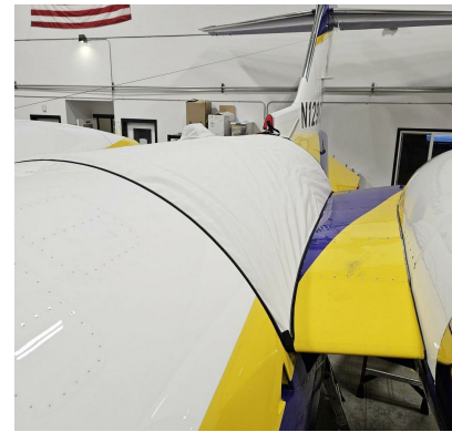
Lear 45 Empennage Saddle Cover W/ Dorsal Inlet Plug (Covers Upper Fuselage Between Pylons, Acm/Apu Area)