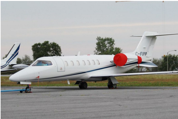
Lear 45 Engine Covers