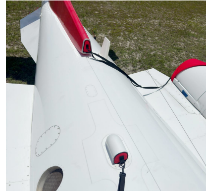
Lear 45 Dorsal, ACM & Fuel Vent Inlet Plugs