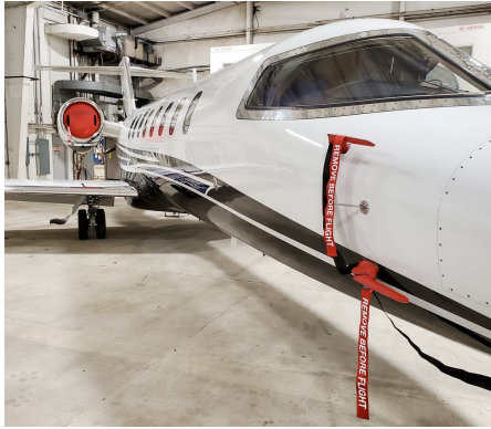
Lear 45 Intake/Exhaust Plug Set

The Engine Inlet Plugs are custom fit for your Lear Models 40 & 45 intakes, made with heavy-duty vinyl material, and stuffed with a single block of sculpted urethane foam. Each plug has a zipper that allows the foam to be removed and dried if necessary. Engine plugs have 'remove before flight' streamers sewn onto the face of the plugs. Most plugs are imprinted with the aircraft registration number in black for an extra charge. Storage bag NOT included. Engine plugs may be inserted after flight when the engine is still warm. Engine Inlet Plugs are commonly referred to as Cowl Plugs, Intake Plugs, Cowl Blocks, Engine Blocks, and Engine Bungs.