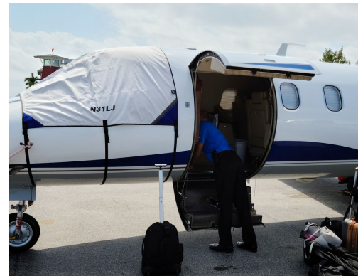
Lear 31A Cockpit Cover