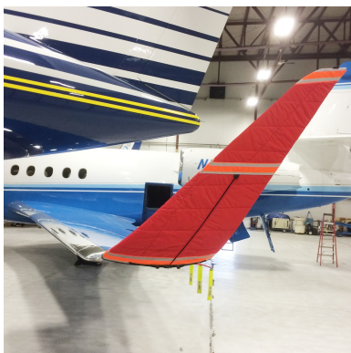
Falcon 2000 Winglet Pad