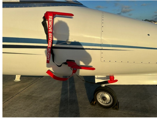
Lear 45 Pitot Cover Set