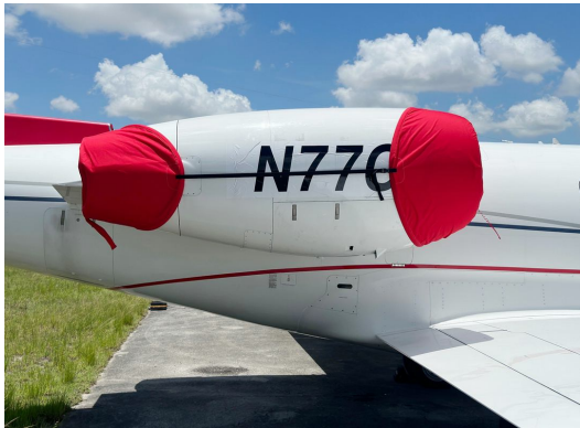
Lear 45 Engine Covers

The Lear Models 40 & 45 Bikini Style Engine Covers are a single-piece design using a soft and smooth stretchy and fabric. The cover stretches tightly over both the intake and exhaust, installing quickly and easily. These covers are designed to be used as hangar dust covers and have a useful life of approximately one year.