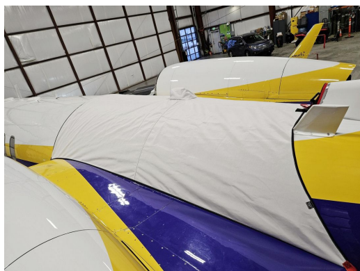
Lear 45 Empennage Saddle Cover W/ Dorsal Inlet Plug (Covers Upper Fuselage Between Pylons, Acm/Apu Area)

WINTER USE MATERIAL - Made with Solution-Dyed Polyester fabric, this option is intended for seasonal use to aid in deicing, rain mitigation, or for occasional travel. The material is lighter and more compact, but more susceptible to UV damage and may have a shorter useful life if used continuously outside than the all-year use material.