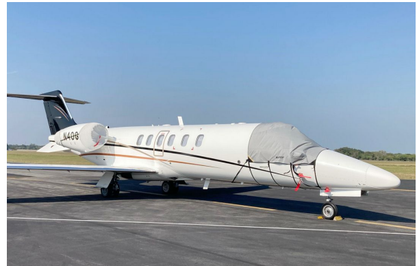
Lear 45 Light Weight Travel Cockpit Cover