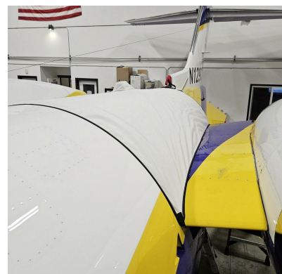
Lear 45 Empennage Saddle Cover W/ Dorsal Inlet Plug (Covers Upper Fuselage Between Pylons, Acm/Apu Area)