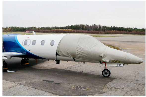
Learjet Cockpit/Nose Cover