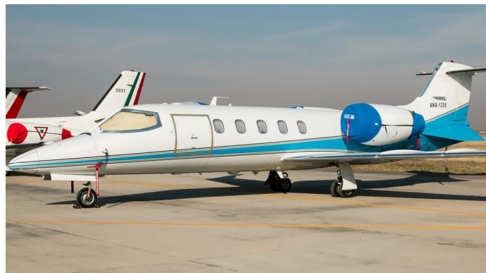
Lear 35 Engine & Pitot Covers