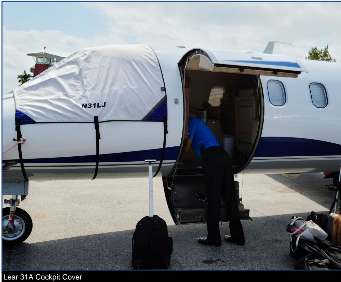
Lear 31A Cockpit Cover