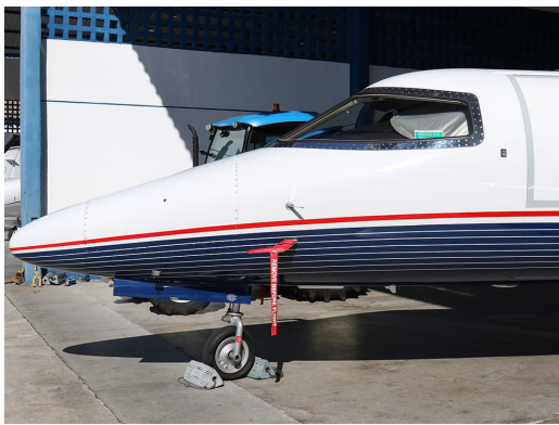
Lear Pitot Cover