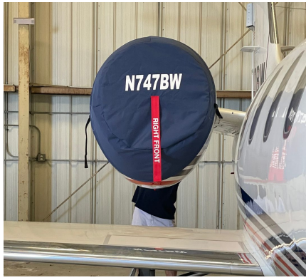
Lear 35A Engine Covers