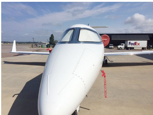
Lear Models 40 & 45 Cockpit Heatshields, Covers All Cockpit Windows

Cockpit Heatshields are interior sunshades for the aircraft's cockpit. The product is a unique composite of closed-cell foam with a silver mylar finish. The semi-rigid design is stiff enough to stand inside the window framing. The set folds up flat and is easily stored in the included storage sleeve. Some designs may require velcro and suction cups. Our Heatshields for jets are offered white side out because some aircraft manufacturers have issued advisories against reflective window inserts due to potential heat damage. A Heatshield is an excellent short-term remedy for cockpit overheating, but an external fabric cover is more effective for long-term protection.