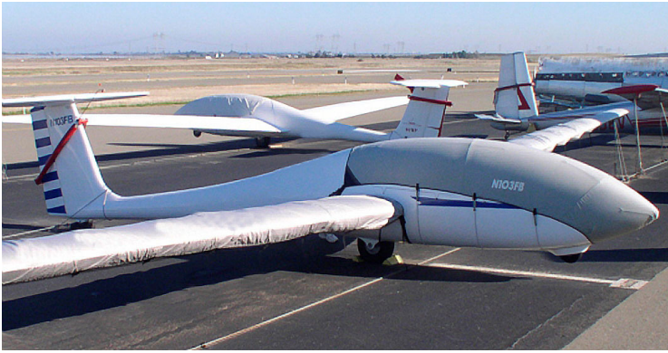
Grob 103 Canopy/Nose Cover and Wing Covers

the hottest of days. It is water, ice and snow repellent, yet breathable to allow moisture to escape from between the cover and the aircraft surface.