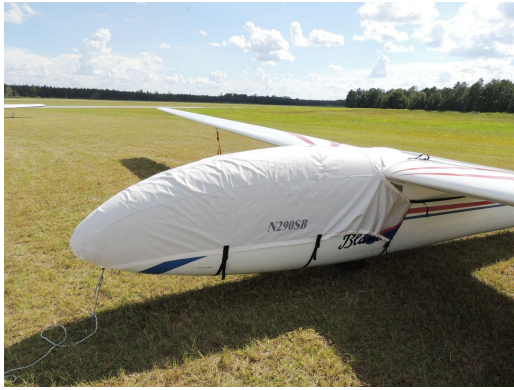
Blanik L23 Canopy/Nose Cover, All Year Use

the hottest of days. It is water, ice and snow repellent, yet breathable to allow moisture to escape from between the cover and the aircraft surface.