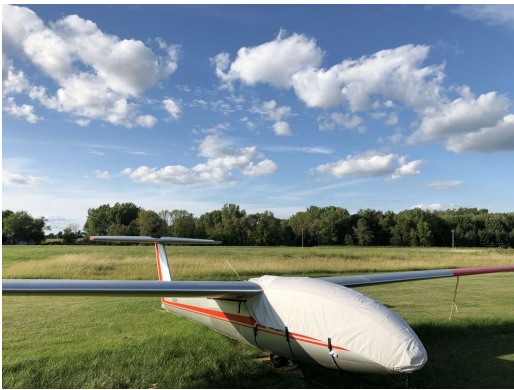
L-23 Super Blanik Canopy/Nose Cover