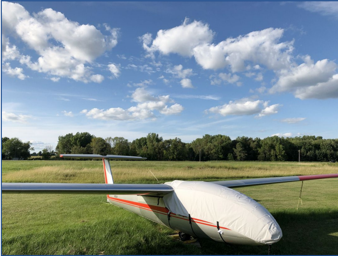
L-23 Super Blanik Canopy/Nose Cover