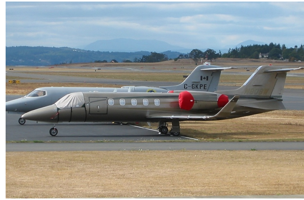
Lear 31A Cockpit Cover, Engine Covers