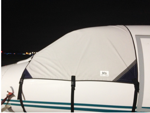
Lear 31 Cockpit Cover

Travel Covers are made with Silver Solution-Dyed Polyester fabric and only lined over the windshield to save weight. The material is lightweight and more compact for easy stowage in the aircraft. The polyester material is water resistant, but only intended for occasional use outside. We also have an ultra lightweight material available for fitted hangar dust covers. For daily outdoor use, the non-travel Sunbrella Cover is the best choice.