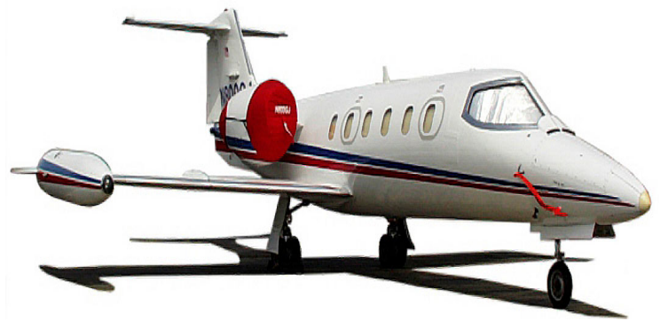
Lear 35 Engine Covers, Pitot Covers & Cockpit HeatShields