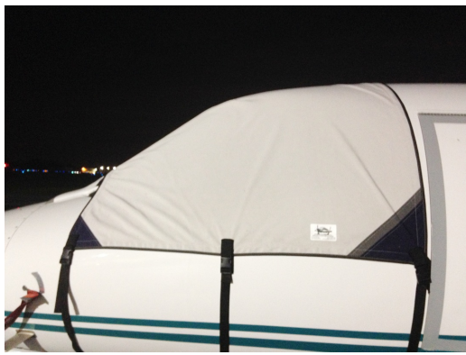
Lear 31 Cockpit Cover