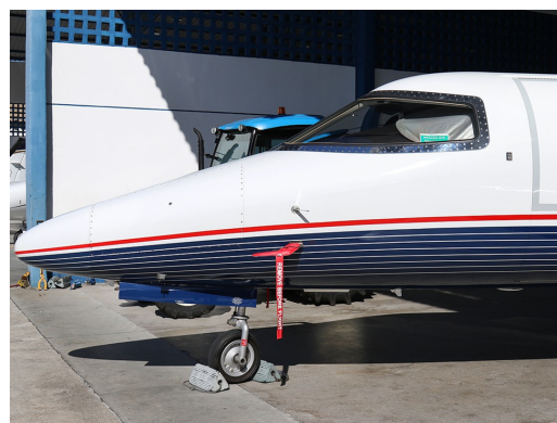
Lear Pitot Cover