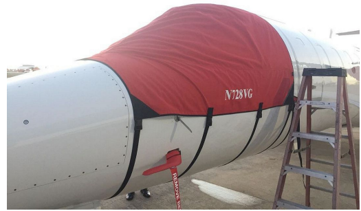
Learjet 45 Cockpit Cover