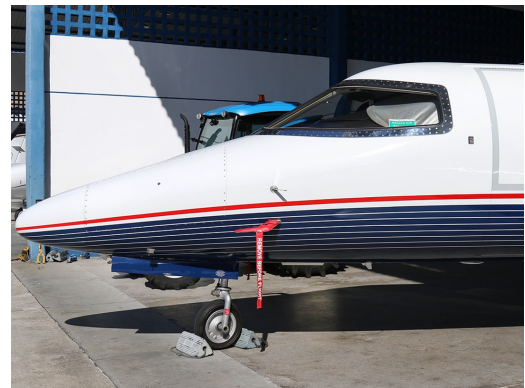
Lear Pitot Cover