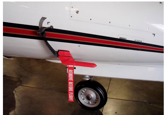
Learjet Heat Resistant Pitot Cover with AOA strap