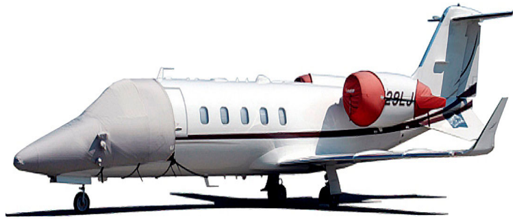
Lear 45 Windshield/Nose & Engine Cover Set