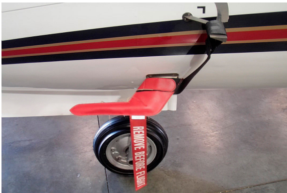
Learjet Heat Resistant Pitot Cover and AOA Strap

The Engine Inlet Plugs are custom fit for your Lear 24 & 25 intakes, made with heavy-duty vinyl material, and stuffed with a single block of sculpted urethane foam. Each plug has a zipper that allows the foam to be removed and dried if necessary. Engine plugs have 'remove before flight' streamers sewn onto the face of the plugs. Most plugs are imprinted with the aircraft registration number in black for an extra charge. Storage bag NOT included. Engine plugs may be inserted after flight when the engine is still warm. Engine Inlet Plugs are commonly referred to as Cowl Plugs, Intake Plugs, Cowl Blocks, Engine Blocks, and Engine Bungs.