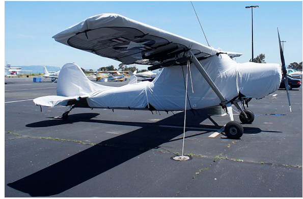
Wing Covers on Cessna Bird Dog