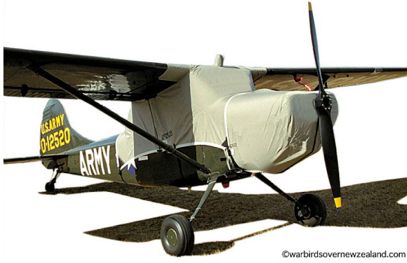
Cessna L-19 Canopy & Engine Covers

The material is very reflective, and tests show that the cabin interior temperature can be reduced to near-ambient temperature on the hottest of days. It is water, ice and snow repellent, yet breathable to allow moisture to escape from between the cover and the aircraft surface.