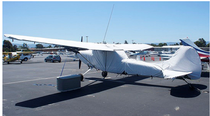
Cessna L-19 Extended Over-the-top Canopy, Engine, Empennage & Wing Covers