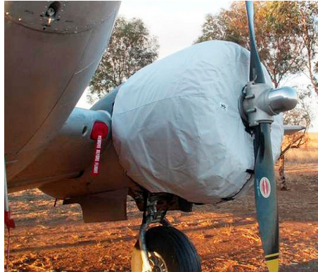
Beech D-18 Engine Covers, Center Section Oil Cooler Inlet Plugs, and Pitot Covers

This cover type is made from Silver Acrylic Sunbrella canvas and is 100% lined with a soft and smooth microfiber. Bruce's Custom Covers developed this material combination especially for aircraft protection. The outer material is medium weight and treated for water resistance, UV resistance and anti-static buildup. The inner lining is a very soft and smooth microfiber to prevent scratching. The material is very reflective, and tests show that the cabin interior temperature can be reduced to near-ambient temperature on the hottest of days. It is water, ice and snow repellent, yet breathable to allow moisture to escape from between the cover and the aircraft surface.