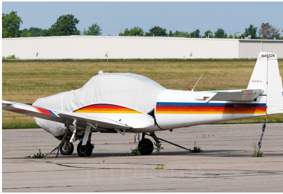
Navion Canopy Cover, Engine Cover (fully enclosed)