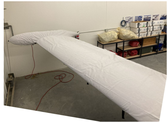
Navion Rangemaster Wing Covers