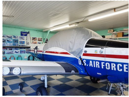
Navion L-17 Travel Cover, Light Weight Canopy Cover (w/without avionics bay extension)