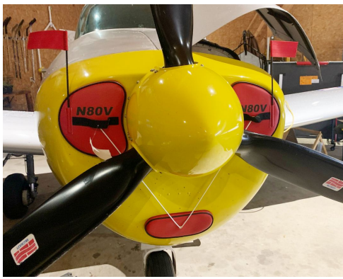
Navion L17 Engine Inlet Plugs