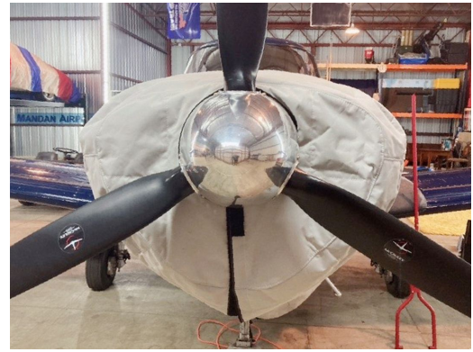
Navion Insulated Engine Cover