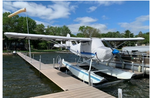
Aeronca 7GC Amphib Cover Set, AFTER