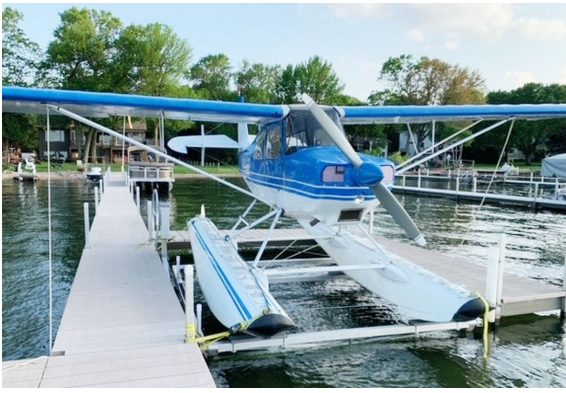
Aeronca 7GC Amphib Cover Set, BEFORE