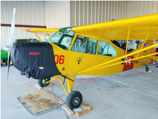
Aeronca 7AC Insulated Engine Cover

This cover type is made from Silver Acrylic Sunbrella canvas and is 100% lined with a soft and smooth microfiber. Bruce's Custom Covers developed this material combination especially for aircraft protection. The outer material is medium weight and treated for water resistance, UV resistance and anti-static buildup. The inner lining is a very soft and smooth microfiber to prevent scratching. The material is very reflective, and tests show that the cabin interior temperature can be reduced to near-ambient temperature on the hottest of days. It is water, ice and snow repellent, yet breathable to allow moisture to escape from between the cover and the aircraft surface.