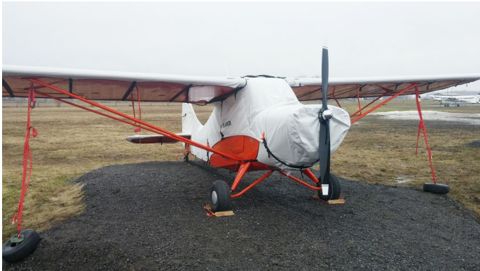
Aeronca Champ 7EC Canopy, Engine, Wing & Empennage Covers