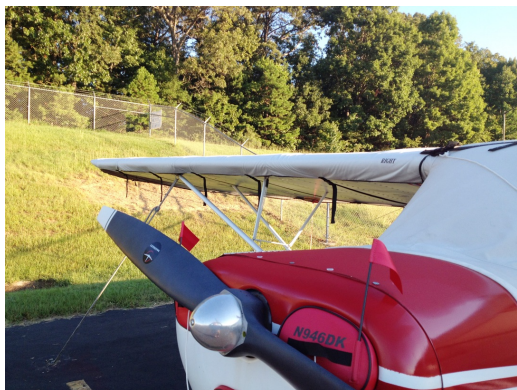
Aeronca Champ Engine Plugs, Wing Covers