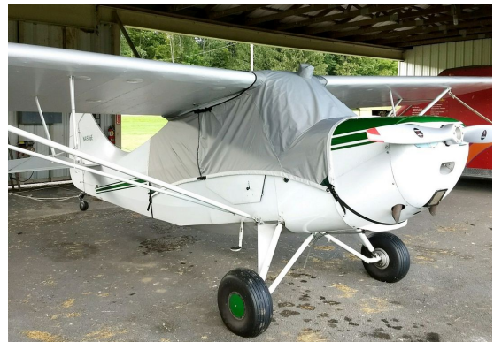
Aeronca Champ Light Weight Travel Canopy Cover, Over-Top Style