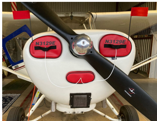
Aeronca Champ Engine Plugs