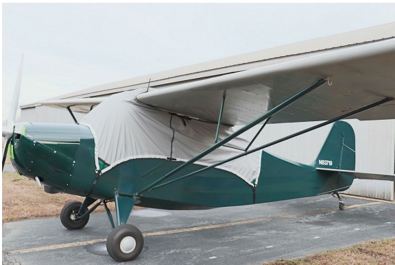
Aeronca 7AC Over-Top Canopy Cover, Light Weight Travel Type

This cover type is made from Silver Acrylic Sunbrella canvas and is 100% lined with a soft and smooth microfiber. Bruce's Custom Covers developed this material combination especially for aircraft protection. The outer material is medium weight and treated for water resistance, UV resistance and anti-static buildup. The inner lining is a very soft and smooth microfiber to prevent scratching. The material is very reflective, and tests show that the cabin interior temperature can be reduced to near-ambient temperature on the hottest of days. It is water, ice and snow repellent, yet breathable to allow moisture to escape from between the cover and the aircraft surface.