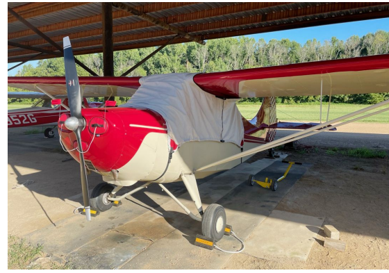
Aeronca Champ Over-Top Canopy Cover, Engine Plugs