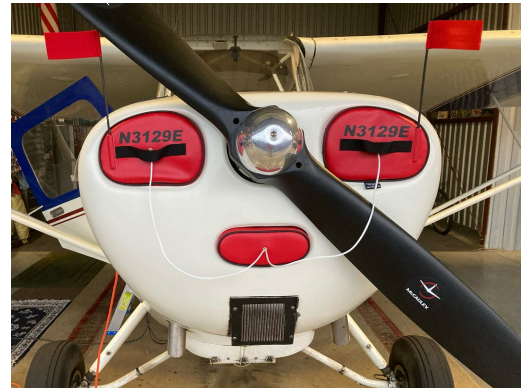
Aeronca Champ Engine Plugs