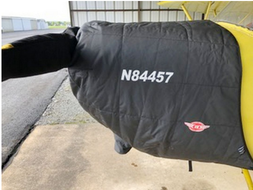
Aeronca Champ Insulated Engine Cover

This cover type is made from Silver Acrylic Sunbrella canvas and is 100% lined with a soft and smooth microfiber. Bruce's Custom Covers developed this material combination especially for aircraft protection. The outer material is medium weight and treated for water resistance, UV resistance and anti-static buildup. The inner lining is a very soft and smooth microfiber to prevent scratching. The material is very reflective, and tests show that the cabin interior temperature can be reduced to near-ambient temperature on the hottest of days. It is water, ice and snow repellent, yet breathable to allow moisture to escape from between the cover and the aircraft surface.