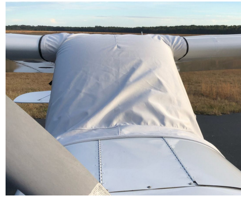
Aeronca 7AC Over The Top Style Canopy Cover