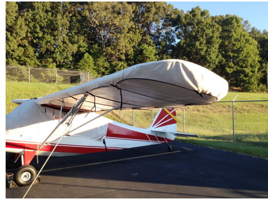
Aeronca Champ Wing Covers, Canopy Cover