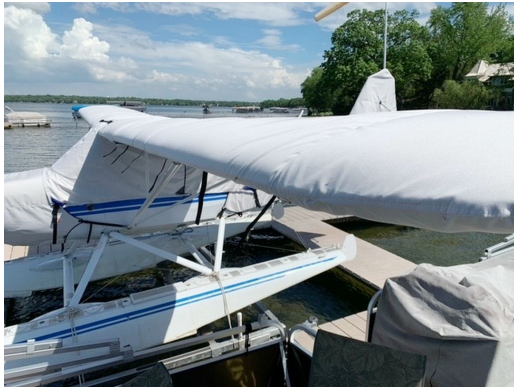
Aeronca 7GC Amphib Cover Set

This cover type is made from Silver Acrylic Sunbrella canvas and is 100% lined with a soft and smooth microfiber. Bruce's Custom Covers developed this material combination especially for aircraft protection. The outer material is medium weight and treated for water resistance, UV resistance and anti-static buildup. The inner lining is a very soft and smooth microfiber to prevent scratching. The material is very reflective, and tests show that the cabin interior temperature can be reduced to near-ambient temperature on the hottest of days. It is water, ice and snow repellent, yet breathable to allow moisture to escape from between the cover and the aircraft surface.