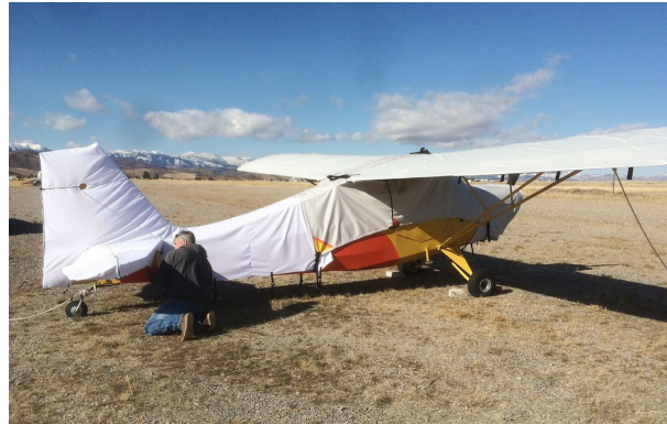
Aeronca Champ Canopy, Wings, Engine & Empennage (test fit) Covers