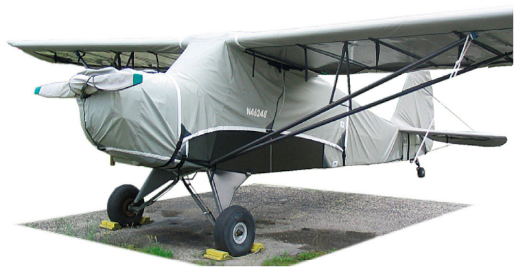
Aeronca Champ 7AC/7EC Empennage Cover Prop Cover, Engine Cover, Canopy Cover, Wing Covers and Empennage Cover