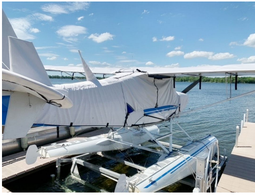
Aeronca 7GC Amphib Cover Set