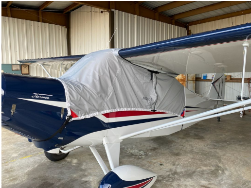
Aeronca Champ Travel Weight Canopy Cover