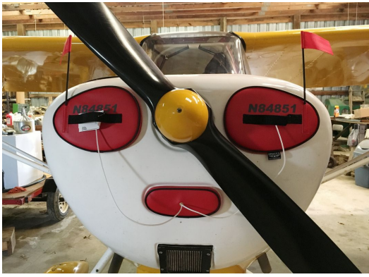
Aeronca 7AC Engine Inlet Plugs