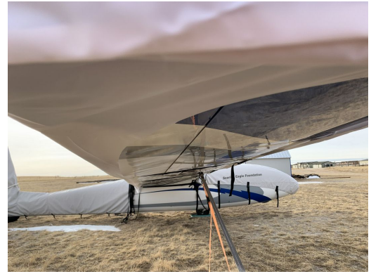
Blanik L-13 Canopy/Nose & Empennage Covers