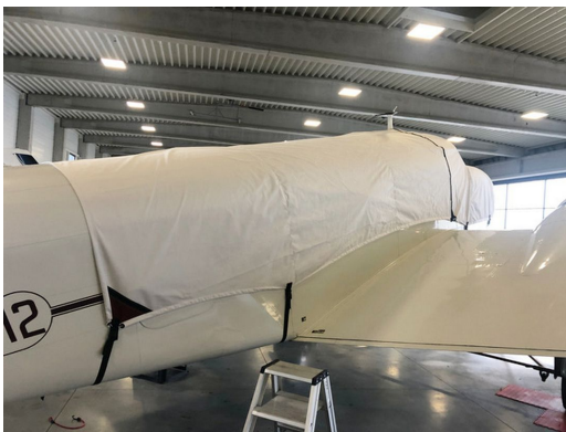
Lockheed 12 Canopy/Nose Cover

This cover type is made from Silver Acrylic Sunbrella canvas and is 100% lined with a soft and smooth microfiber. Bruce's Custom Covers developed this material combination especially for aircraft protection. The outer material is medium weight and treated for water resistance, UV resistance and anti-static buildup. The inner lining is a very soft and smooth microfiber to prevent scratching. The material is very reflective, and tests show that the cabin interior temperature can be reduced to near-ambient temperature on the hottest of days. It is water, ice and snow repellent, yet breathable to allow moisture to escape from between the cover and the aircraft surface.