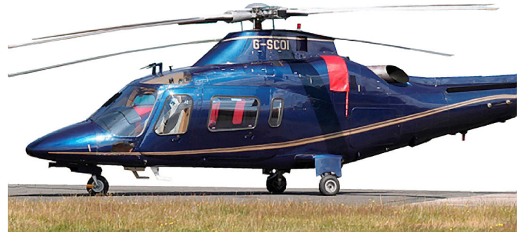
Agusta Power Intake Cover