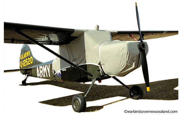
Cessna L-19 Canopy & Engine Covers