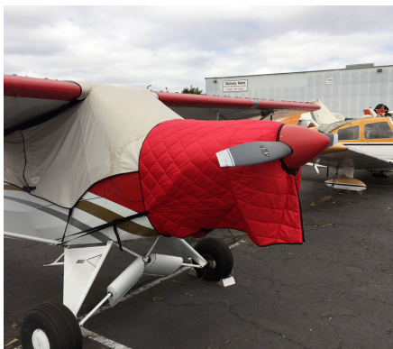
FOR INTERIOR USE. Cub Crafters CC-11 Insulated Hangar Blanket, available in Red or Silver

This cover type is made from Silver Acrylic Sunbrella canvas and is 100% lined with a soft and smooth microfiber. Bruce's Custom Covers developed this material combination especially for aircraft protection. The outer material is medium weight and treated for water resistance, UV resistance and anti-static buildup. The inner lining is a very soft and smooth microfiber to prevent scratching. The material is very reflective, and tests show that the cabin interior temperature can be reduced to near-ambient temperature on the hottest of days. It is water, ice and snow repellent, yet breathable to allow moisture to escape from between the cover and the aircraft surface.