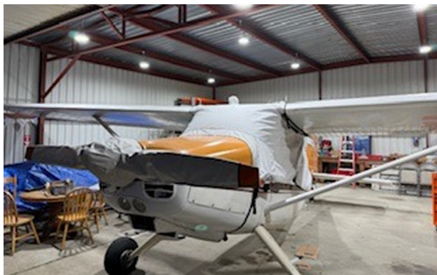
Luscombe Models 11A & 11E: Canopy Cover, Prop Cover

This cover type is made from Silver Acrylic Sunbrella canvas and is 100% lined with a soft and smooth microfiber. Bruce's Custom Covers developed this material combination especially for aircraft protection. The outer material is medium weight and treated for water resistance, UV resistance and anti-static buildup. The inner lining is a very soft and smooth microfiber to prevent scratching. The material is very reflective, and tests show that the cabin interior temperature can be reduced to near-ambient temperature on the hottest of days. It is water, ice and snow repellent, yet breathable to allow moisture to escape from between the cover and the aircraft surface.