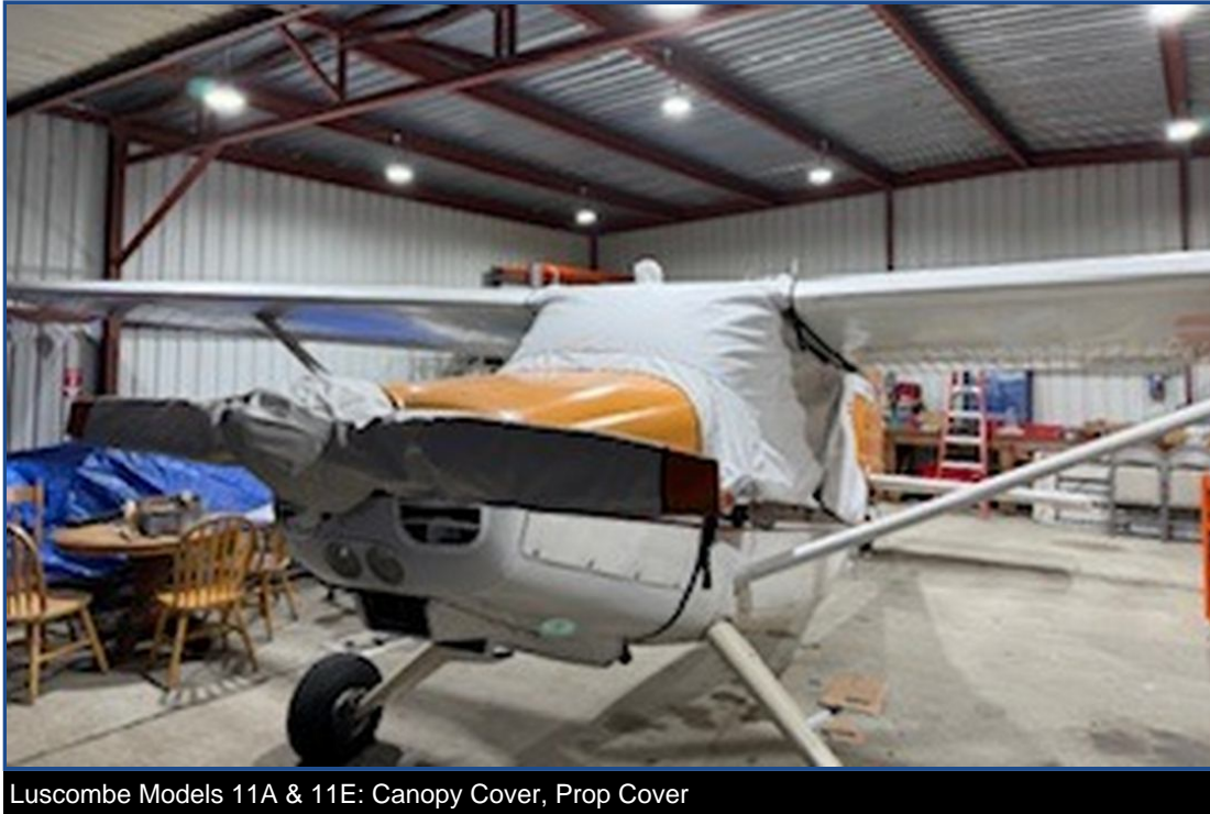
Luscombe Models 11A &amp; 11E: Canopy Cover, Prop Cover