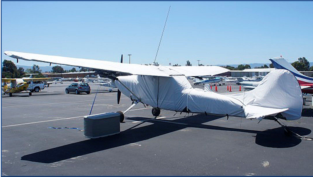
Cessna L-19 Extended Over-the-top Canopy, Engine, Empennage &amp; Wing Covers