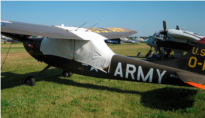
L-19 Canopy Cover

water resistance, UV resistance and anti-static buildup. The inner lining is a very soft and smooth microfiber to prevent scratching. The material is very reflective, and tests show that the cabin interior temperature can be reduced to near-ambient temperature on the hottest of days. It is water, ice and snow repellent, yet breathable to allow moisture to escape from between the cover and the aircraft surface.