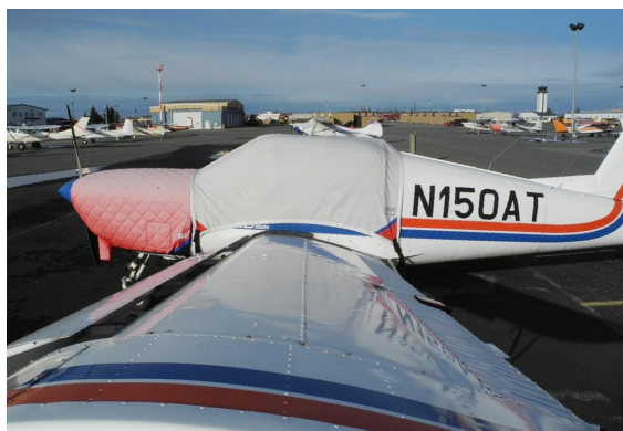
Koliber 150A Canopy Cover, Insulated Engine Cover