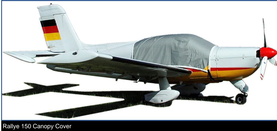
Rallye 150 Canopy Cover