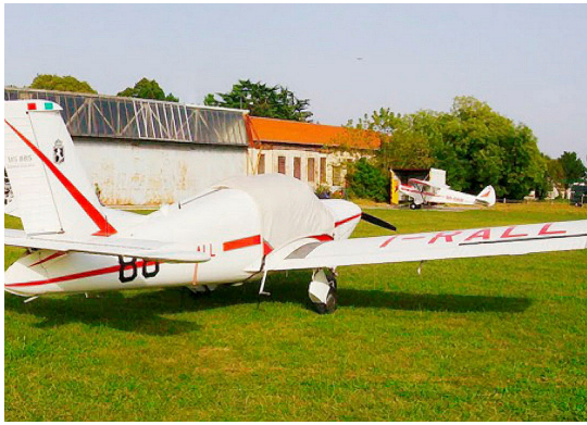
Standard Canopy Cover for MS893A