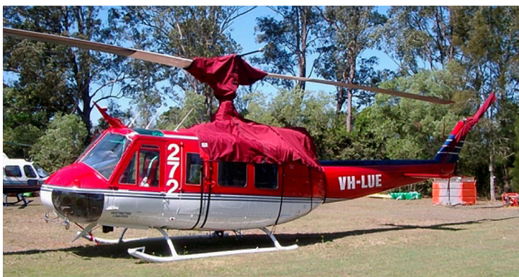
Bell 204/205 Engine/Mid-Cabin Cover, Main & Tail Rotor Covers