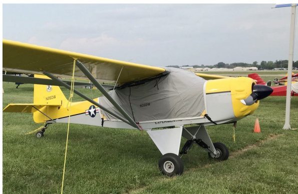
Kitfox Travel Canopy Cover

Travel Covers are made with Silver Solution-Dyed Polyester fabric and only lined over the windshield to save weight. The material is lightweight and more compact for easy stowage in the aircraft. The polyester material is water resistant, but only intended for occasional use outside. We also have an ultra lightweight material available for fitted hangar dust covers. For daily outdoor use, the non-travel Sunbrella Cover is the best choice.