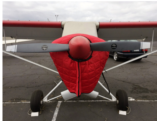
Kitfox Engine Cover, "Radial Cowl" type, test fit FOR INTERIOR USE. Cub Crafters CC-11 Insulated Hangar Blanket, available in Red or Silver