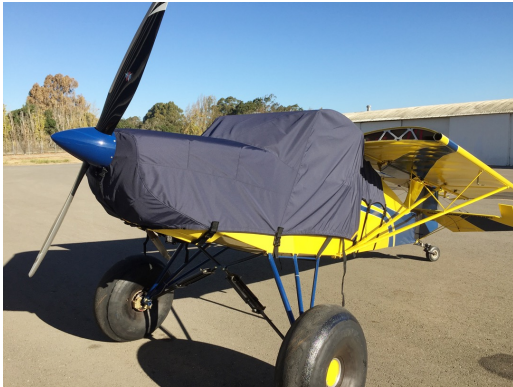
Just Highlander Trailering Covers, set of 2

This cover type is made from Silver Acrylic Sunbrella canvas and is 100% lined with a soft and smooth microfiber. Bruce's Custom Covers developed this material combination especially for aircraft protection. The outer material is medium weight and treated for water resistance, UV resistance and anti-static buildup. The inner lining is a very soft and smooth microfiber to prevent scratching. The material is very reflective, and tests show that the cabin interior temperature can be reduced to near-ambient temperature on the hottest of days. It is water, ice and snow repellent, yet breathable to allow moisture to escape from between the cover and the aircraft surface.