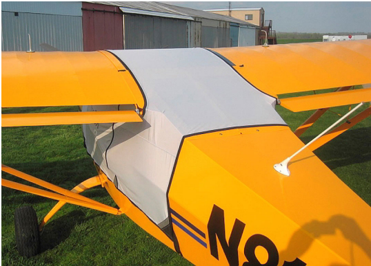
Aerotrek A240 Spandex FlyAway Travel Canopy Cover