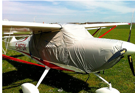
EuroFox and Aerotrek A240 Lightweight Travel Canopy/Engine Cover