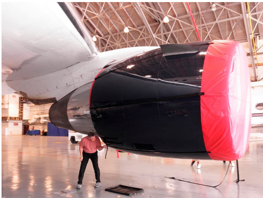
Boeing 767 Intake Covers Ship Set