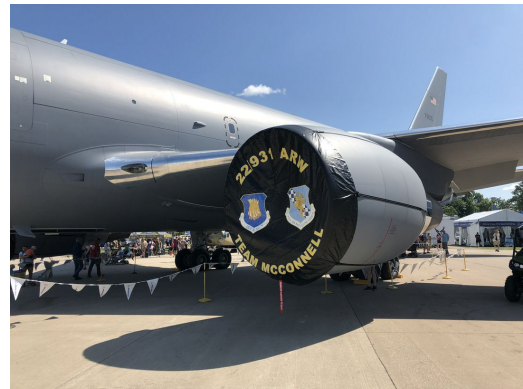
Boeing KC-46 Intake Cover