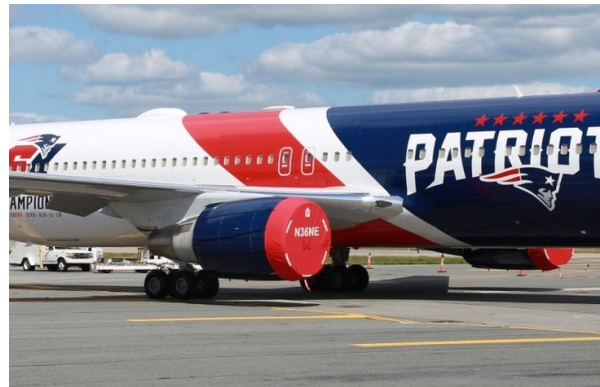
Boeing 767 Intake Covers