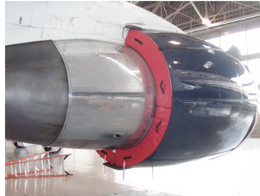
Boeing 767 Exhaust Plugs Ship Set, incl. Fan Thrust Reverser and Exhaust Plugs P/N: B767-200