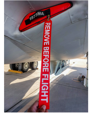
KC-135 ACM Inlet Plug