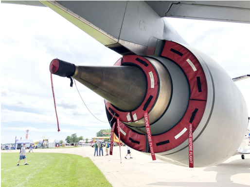
Boeing KC-135 Bypass and Exhaust Plugs