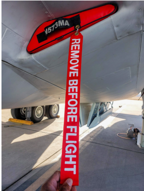
KC-135 ACM Inlet Plug

The Engine Inlet Plugs are custom fit for your Boeing KC-135, C-135, RC-135, EC-135 intakes, made with heavy-duty vinyl material, and stuffed with a single block of sculpted urethane foam. Each plug has a zipper that allows the foam to be removed and dried if necessary. Engine plugs have 'remove before flight' streamers sewn onto the face of the plugs. Most plugs are imprinted with the aircraft registration number in black for an extra charge. Storage bag NOT included. Engine plugs may be inserted after flight when the engine is still warm. Engine Inlet Plugs are commonly referred to as Cowl Plugs, Intake Plugs, Cowl Blocks, Engine Blocks, and Engine Bungs.