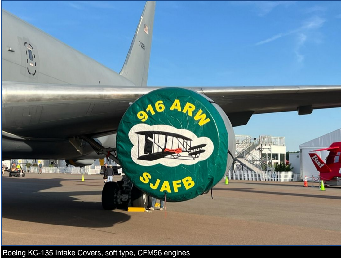
Boeing KC-135 Intake Covers, soft type, CFM56 engines