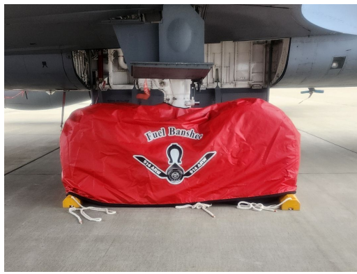
Boeing KC-135 Main Gear Tire Covers