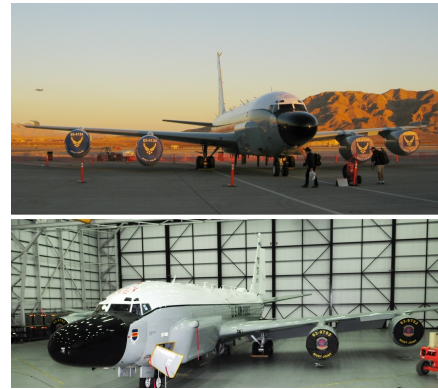
KC-135 & RC-135 Intake Covers, Tamborine Type