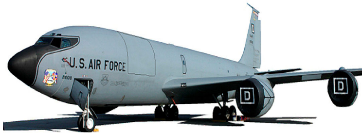
KC-135 "soft" type Intake Covers

The Boeing KC-135, C-135, RC-135, EC-135 Intake Covers are designed to install easily yet be completely storable. A spring steel hoop is sewn into the hem of each cover, allowing them to be installed without climbing onto the wing or using a stepladder. To store the covers the spring steel hoop folds like a band-saw blade into three nesting rings. Each cover folds into a compact circular bundle which is stored in the included duffle bag, yet they unfold quickly for use. The Tri-Fold Ring cover is made of medium weight nylon which is available in a variety of colors to match the paint trim. Each cover set comes complete with installation and folding instructions. The aircraft's registration number can be silkscreened onto the cover for an extra charge.