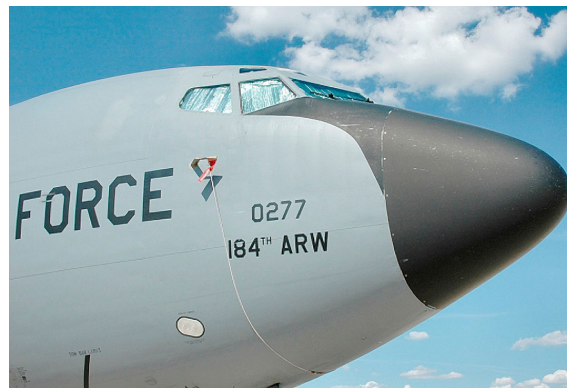
KC-135 Cockpit HeatShields

Cockpit Heatshields are interior sunshades for the aircraft's cockpit. The product is a unique composite of closed-cell foam with a silver mylar finish. The semi-rigid design is stiff enough to stand inside the window framing. The set folds up flat and is easily stored in the included storage sleeve. Some designs may require velcro and suction cups. Our Heatshields for jets are offered white side out because some aircraft manufacturers have issued advisories against reflective window inserts due to potential heat damage. A Heatshield is an excellent short-term remedy for cockpit overheating, but an external fabric cover is more effective for long-term protection.