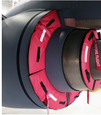
Boeing KC-135 Bypass Vent & Exhaust Plugs

The Engine Inlet Plugs are custom fit for your Boeing KC-135, C-135, RC-135, EC-135 intakes, made with heavy-duty vinyl material, and stuffed with a single block of sculpted urethane foam. Each plug has a zipper that allows the foam to be removed and dried if necessary. Engine plugs have 'remove before flight' streamers sewn onto the face of the plugs. Most plugs are imprinted with the aircraft registration number in black for an extra charge. Storage bag NOT included. Engine plugs may be inserted after flight when the engine is still warm. Engine Inlet Plugs are commonly referred to as Cowl Plugs, Intake Plugs, Cowl Blocks, Engine Blocks, and Engine Bungs.