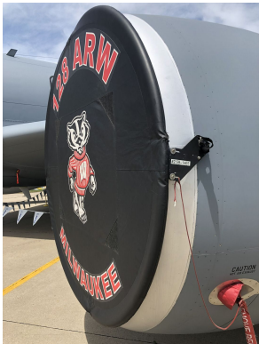
Boeing KC-135 Intake Covers, Tamborine Type