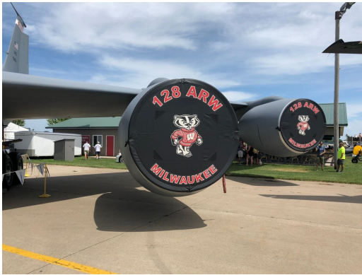
Boeing KC-135 Intake Covers, Tamborine Style

The Boeing KC-135, C-135, RC-135, EC-135 Intake Covers are designed to install easily yet be completely storable. A spring steel hoop is sewn into the hem of each cover, allowing them to be installed without climbing onto the wing or using a stepladder. To store the covers the spring steel hoop folds like a band-saw blade into three nesting rings. Each cover folds into a compact circular bundle which is stored in the included duffle bag, yet they unfold quickly for use. The Tri-Fold Ring cover is made of medium weight nylon which is available in a variety of colors to match the paint trim. Each cover set comes complete with installation and folding instructions. The aircraft's registration number can be silkscreened onto the cover for an extra charge.