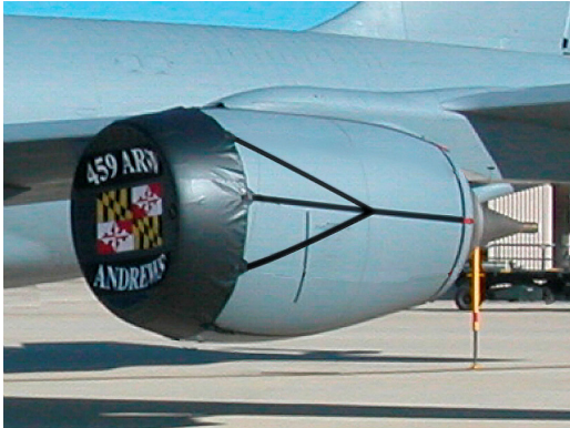
KC-135 "soft" type Intake Cover

The Engine Inlet Plugs are custom fit for your Boeing KC-135, C-135, RC-135, EC-135 intakes, made with heavy-duty vinyl material, and stuffed with a single block of sculpted urethane foam. Each plug has a zipper that allows the foam to be removed and dried if necessary. Engine plugs have 'remove before flight' streamers sewn onto the face of the plugs. Most plugs are imprinted with the aircraft registration number in black for an extra charge. Storage bag NOT included. Engine plugs may be inserted after flight when the engine is still warm. Engine Inlet Plugs are commonly referred to as Cowl Plugs, Intake Plugs, Cowl Blocks, Engine Blocks, and Engine Bungs.