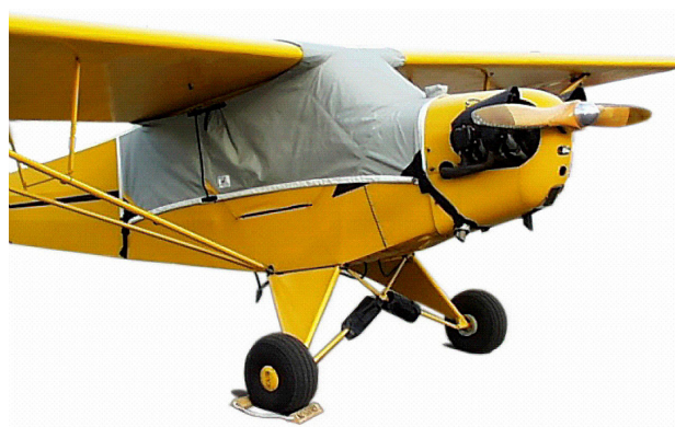
Piper J3 Canopy Cover