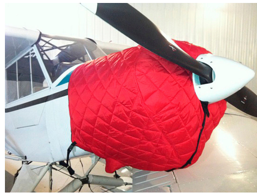
Piper Super Cub Insulated Engine Cover