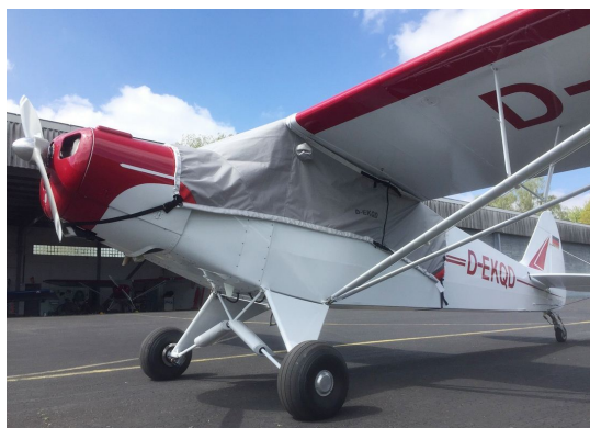
Piper Super Cub Travel Weight Canopy Cover

This cover type is made from Silver Acrylic Sunbrella canvas and is 100% lined with a soft and smooth microfiber. Bruce's Custom Covers developed this material combination especially for aircraft protection. The outer material is medium weight and treated for water resistance, UV resistance and anti-static buildup. The inner lining is a very soft and smooth microfiber to prevent scratching. The material is very reflective, and tests show that the cabin interior temperature can be reduced to near-ambient temperature on the hottest of days. It is water, ice and snow repellent, yet breathable to allow moisture to escape from between the cover and the aircraft surface.