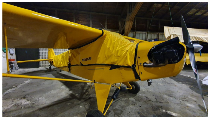
Piper J3 Over The Top Style Canopy Cover & Empennage Cover