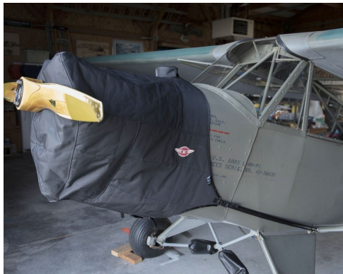
1944 Piper L-4H Insulated Engine Cover

This cover type is made from Silver Acrylic Sunbrella canvas and is 100% lined with a soft and smooth microfiber. Bruce's Custom Covers developed this material combination especially for aircraft protection. The outer material is medium weight and treated for water resistance, UV resistance and anti-static buildup. The inner lining is a very soft and smooth microfiber to prevent scratching. The material is very reflective, and tests show that the cabin interior temperature can be reduced to near-ambient temperature on the hottest of days. It is water, ice and snow repellent, yet breathable to allow moisture to escape from between the cover and the aircraft surface.