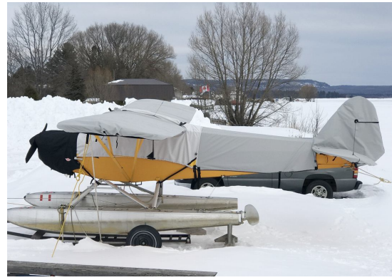
Piper J3 Cub Extended Canopy, Wings, Empennage & Insulated Engine Covers