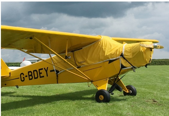
Piper J3 Canopy and Engine Covers, in Custom Sunflower Yellow.

This cover type is made from Silver Acrylic Sunbrella canvas and is 100% lined with a soft and smooth microfiber. Bruce's Custom Covers developed this material combination especially for aircraft protection. The outer material is medium weight and treated for water resistance, UV resistance and anti-static buildup. The inner lining is a very soft and smooth microfiber to prevent scratching. The material is very reflective, and tests show that the cabin interior temperature can be reduced to near-ambient temperature on the hottest of days. It is water, ice and snow repellent, yet breathable to allow moisture to escape from between the cover and the aircraft surface.