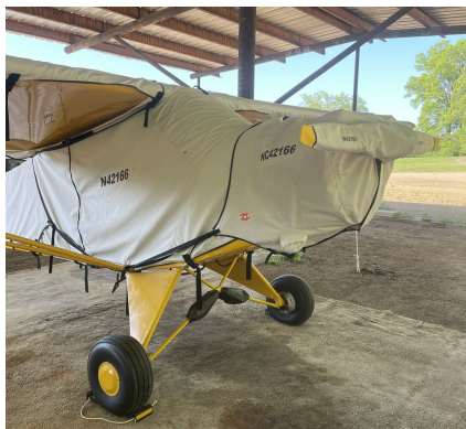
Piper J-3C-65 Cub Engine Cover, Fully Enclosed

WINTER USE MATERIAL - Made with Solution-Dyed Polyester fabric, this option is intended for seasonal use to aid in deicing, rain mitigation, or for occasional travel. The material is lighter and more compact, but more susceptible to UV damage and may have a shorter useful life if used continuously outside than the all-year use material.