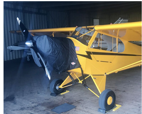
Legend Cub AL3 Insulated Engine Cover