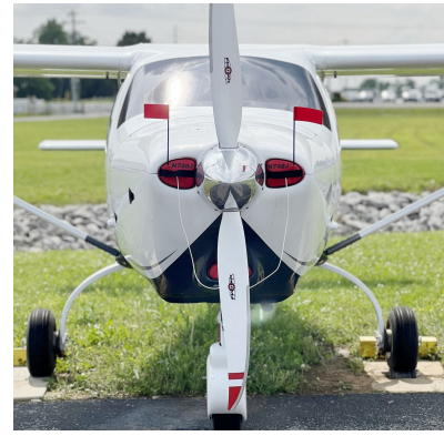
Jabiru J230-SP Engine Inlet Plugs