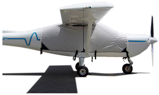
Jabiru Extended Canopy Cover