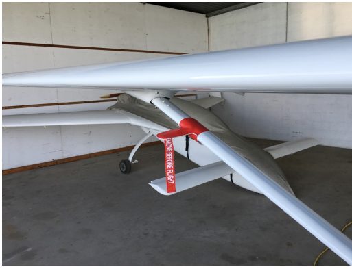
Jabiru Pitot Cover