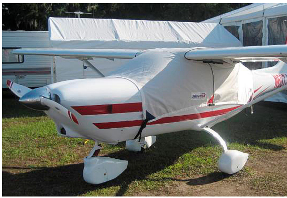
Jabiru 230-SP Canopy Cover, Over-top style