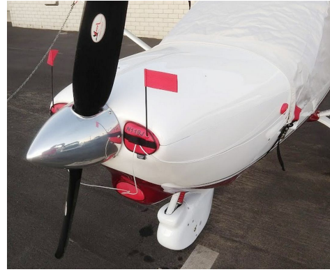
Jabiru 430 Engine Inlet Plugs