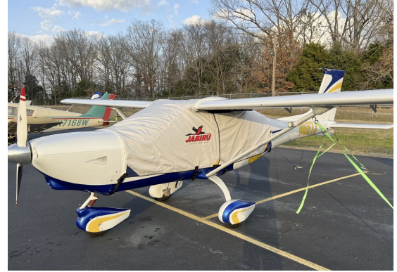
Jabiru J230-SP Extended Canopy Cover