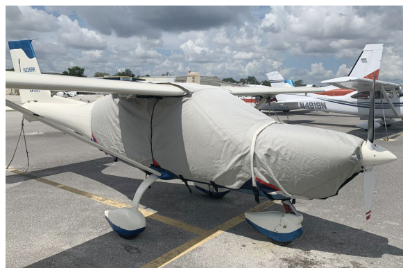
Jabiru 230D Extended Canopy Cover & Engine Covers