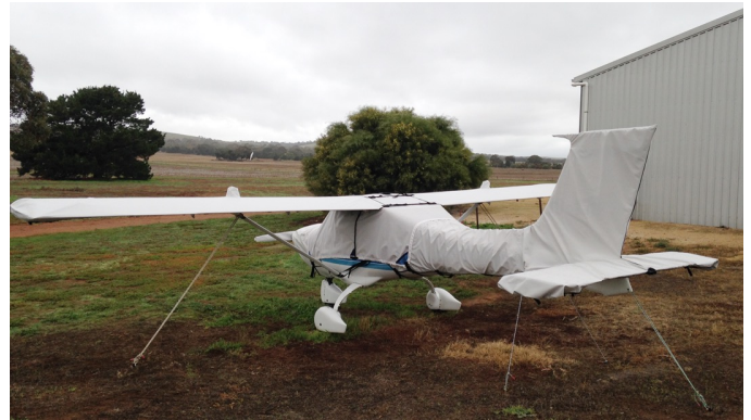
Jabiru 160 Canopy, Engine, Prop, Wings & Empennage Covers Jabiru 160 Canopy, Engine, Prop, Wings & Empennage Covers