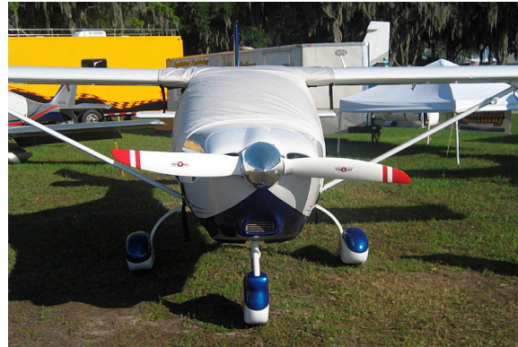
Jabiru 230-SP Canopy Cover, Over-top style