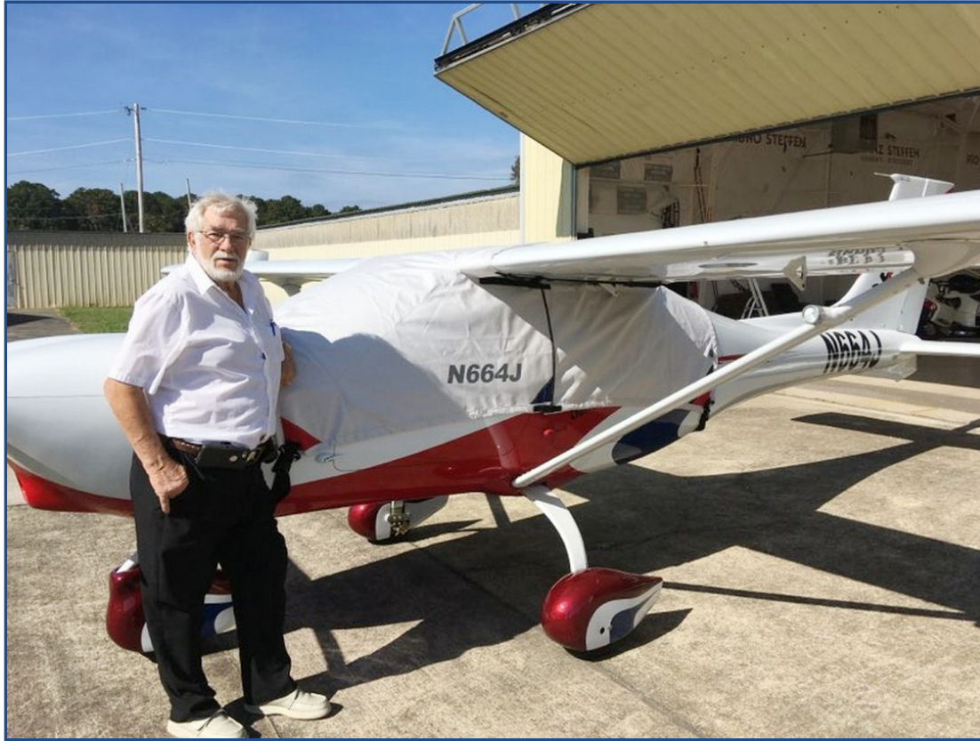
Jabiru 230SP Canopy Cover, Over-Top Style