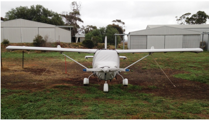
Jabiru 160 Canopy, Engine, Prop, Wings & Empennage Covers

This cover type is made from Silver Acrylic Sunbrella canvas and is 100% lined with a soft and smooth microfiber. Bruce's Custom Covers developed this material combination especially for aircraft protection. The outer material is medium weight and treated for water resistance, UV resistance and anti-static buildup. The inner lining is a very soft and smooth microfiber to prevent scratching. The material is very reflective, and tests show that the cabin interior temperature can be reduced to near-ambient temperature on the hottest of days. It is water, ice and snow repellent, yet breathable to allow moisture to escape from between the cover and the aircraft surface.