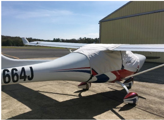
Jabiru J230-SP Canopy Cover, Over-Top Style

This cover type is made from Silver Acrylic Sunbrella canvas and is 100% lined with a soft and smooth microfiber. Bruce's Custom Covers developed this material combination especially for aircraft protection. The outer material is medium weight and treated for water resistance, UV resistance and anti-static buildup. The inner lining is a very soft and smooth microfiber to prevent scratching. The material is very reflective, and tests show that the cabin interior temperature can be reduced to near-ambient temperature on the hottest of days. It is water, ice and snow repellent, yet breathable to allow moisture to escape from between the cover and the aircraft surface.