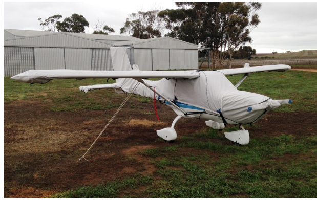
Jabiru 160 Canopy, Engine, Prop, Wings & Empennage Covers