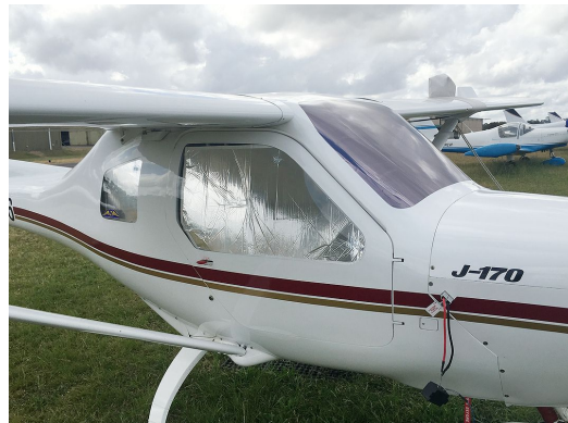
Jabiru 170 Heatshield Set

Heatshields are interior sunshades for an aircraft's windows or canopy glass. The product is a unique composite of closed-cell foam with a silver mylar finish. The semi-rigid design is stiff enough to stand along the inside of the windshield using sun visors or window framing. It folds up flat and easily stores in the included storage sleeve. Some designs may require velcro and suction cups. A Heatshield is an excellent short-term remedy for cockpit overheating.