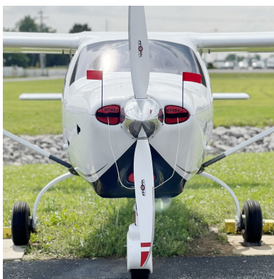
Jabiru J230-SP Engine Inlet Plugs