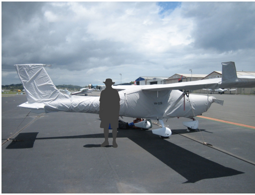
Jabiru J430 Complete Cover Set