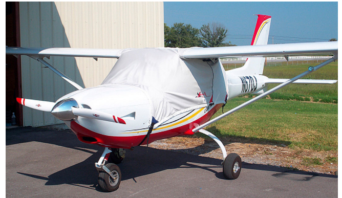
Jabiru 170 Canopy Cover