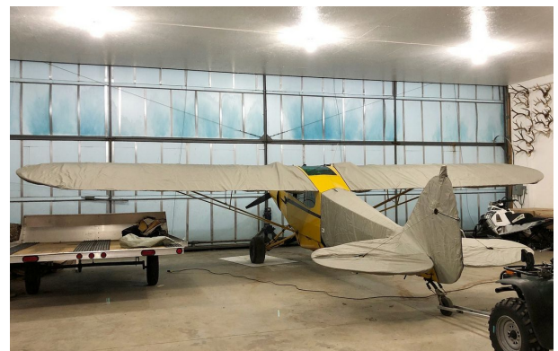
Piper Super Cub Wing & Empennage Covers