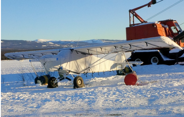
Piper Super Cub Complete Cover Set

ALL-YEAR USE MATERIAL - Made with Silver Acrylic Sunbrella canvas, the all-year use material is the best option for sun protection and cover longevity. This heavier more durable material is intended for all weather conditions, such as rain and snow or lots of sun.