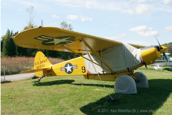
Piper L-21b Extended Canopy Cover, Tire Covers

ALL-YEAR USE MATERIAL - Made with Silver Acrylic Sunbrella canvas, the all-year use material is the best option for sun protection and cover longevity. This heavier more durable material is intended for all weather conditions, such as rain and snow or lots of sun.