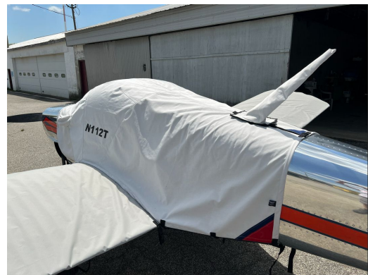
Thorp Sky Scooter Extended Canopy Cover & Wing Covers