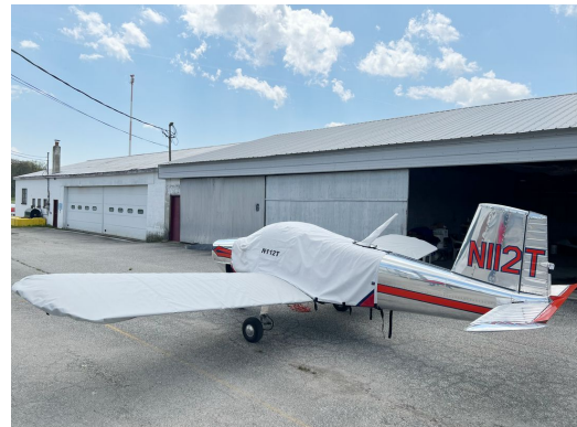
Thorp Sky Scooter Extended Canopy Cover & Wing Covers