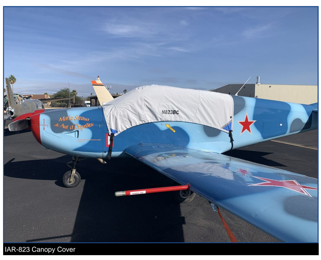
Section 1: Canopy/Cockpit/Fuselage Covers

Canopy Covers help reduce damage to your airplane's upholstery and avionics caused by excessive heat, and they can eliminate problems caused by leaking door and window seals. They keep the windshield and window surfaces clean and help prevent vandalism and theft.