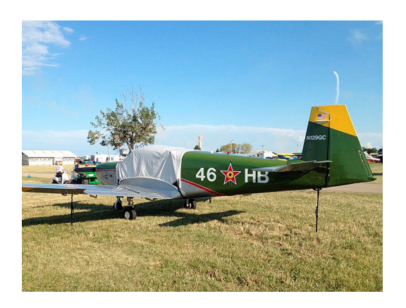
IAR Canopy Cover