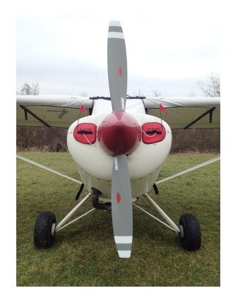
Aviat Husky Engine Plugs, Wing Covers

Engine Inlet Plugs are custom fit for your Aviat (Christen) Husky intakes, made with heavy-duty vinyl material, and stuffed with a single block of sculpted urethane foam. Each plug has a zipper that allows the foam to be removed and dried if necessary. Engine plugs have warning flags that are visible from the cockpit or 'remove before flight' streamers sewn onto the face of the plugs. Most plugs are imprinted with the aircraft registration number in black for an extra charge. Storage bag NOT included. Engine plugs may be inserted after flight when the engine is still warm. Engine Inlet Plugs are commonly referred to as Cowl Plugs, Intake Plugs, Cowl Blocks, Engine Blocks, and Engine Bungs.