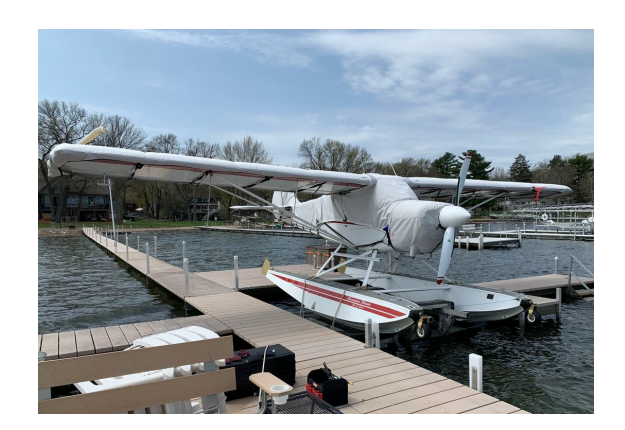
Aviat Husky Canopy, Engine, Wing, Empennage Covers