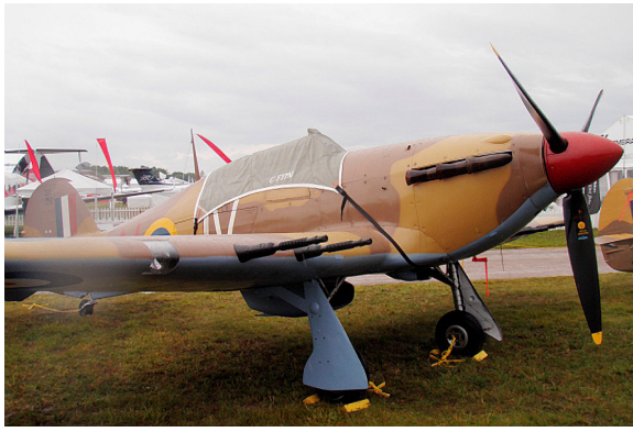
Hawker Hurricane Canopy Cover