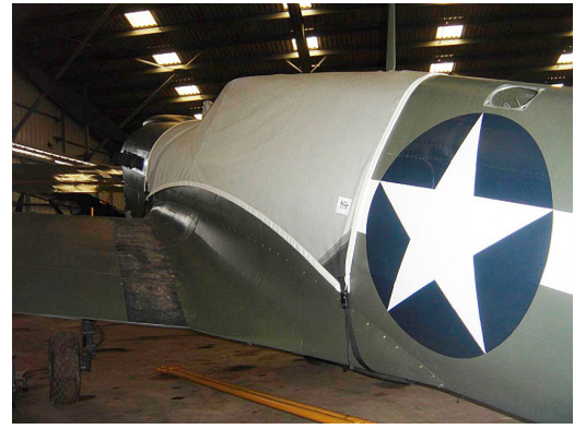
P40 Canopy Cover