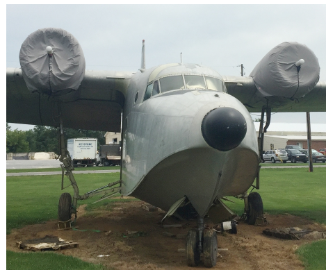
Grumman Albatross Engine Covers