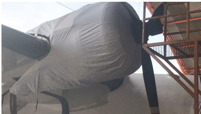
Grumman HU-16 Albatross Engine Cover (test fit cover)

This cover type is made from Silver Acrylic Sunbrella canvas and is 100% lined with a soft and smooth microfiber. Bruce's Custom Covers developed this material combination especially for aircraft protection. The outer material is medium weight and treated for water resistance, UV resistance and anti-static buildup. The inner lining is a very soft and smooth microfiber to prevent scratching. The material is very reflective, and tests show that the cabin interior temperature can be reduced to near-ambient temperature on the hottest of days. It is water, ice and snow repellent, yet breathable to allow moisture to escape from between the cover and the aircraft surface.