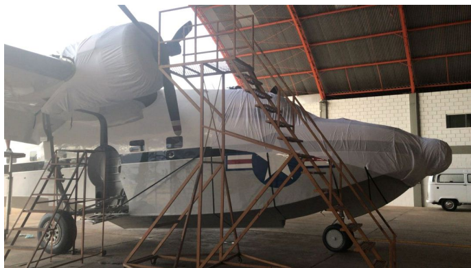
Grumman HU-16 Albatross Cockpit/Nose Cover and Engine Cover(test fit covers)

This cover type is made from Silver Acrylic Sunbrella canvas and is 100% lined with a soft and smooth microfiber. Bruce's Custom Covers developed this material combination especially for aircraft protection. The outer material is medium weight and treated for water resistance, UV resistance and anti-static buildup. The inner lining is a very soft and smooth microfiber to prevent scratching. The material is very reflective, and tests show that the cabin interior temperature can be reduced to near-ambient temperature on the hottest of days. It is water, ice and snow repellent, yet breathable to allow moisture to escape from between the cover and the aircraft surface.