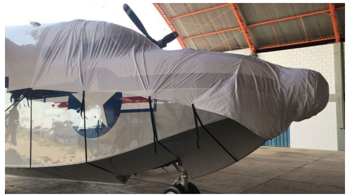
Grumman HU-16 Albatross Cockpit/Nose Cover (test fit cover)