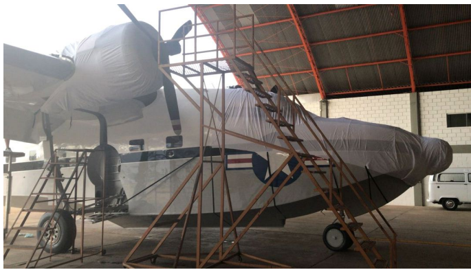
Grumman HU-16 Albatross Cockpit/Nose Cover and Engine Cover(test fit covers)

This cover type is made from Silver Acrylic Sunbrella canvas and is 100% lined with a soft and smooth microfiber. Bruce's Custom Covers developed this material combination especially for aircraft protection. The outer material is medium weight and treated for water resistance, UV resistance and anti-static buildup. The inner lining is a very soft and smooth microfiber to prevent scratching. The material is very reflective, and tests show that the cabin interior temperature can be reduced to near-ambient temperature on the hottest of days. It is water, ice and snow repellent, yet breathable to allow moisture to escape from between the cover and the aircraft surface.