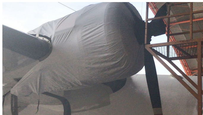
Grumman HU-16 Albatross Engine Cover (test fit cover)