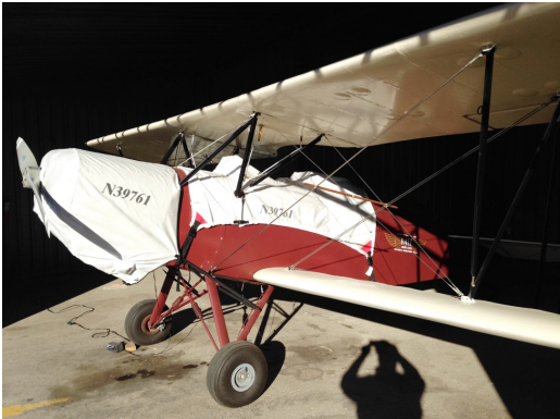
Hatz Biplane Canopy and Engine Covers