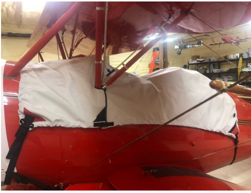
Hatz Biplane CB-1 Canopy Cover