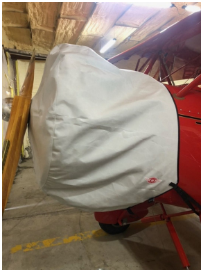
Hatz Biplane CB-1 Engine Cover