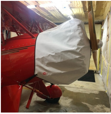
Hatz Biplane CB-1 Engine Cover