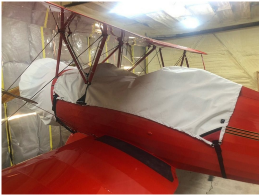
Hatz Biplane CB-1 Canopy Cover & Engine Cover