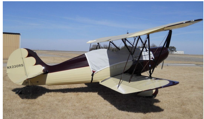
Hatz Biplane Canopy Cover