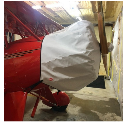
Hatz Biplane CB-1 Engine Cover