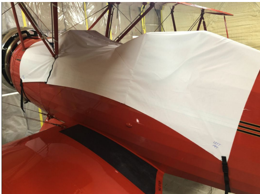
Hatz Biplane Canopy Cover, test fit cover

This cover type is made from Silver Acrylic Sunbrella canvas and is 100% lined with a soft and smooth microfiber. Bruce's Custom Covers developed this material combination especially for aircraft protection. The outer material is medium weight and treated for water resistance, UV resistance and anti-static buildup. The inner lining is a very soft and smooth microfiber to prevent scratching. The material is very reflective, and tests show that the cabin interior temperature can be reduced to near-ambient temperature on the hottest of days. It is water, ice and snow repellent, yet breathable to allow moisture to escape from between the cover and the aircraft surface.