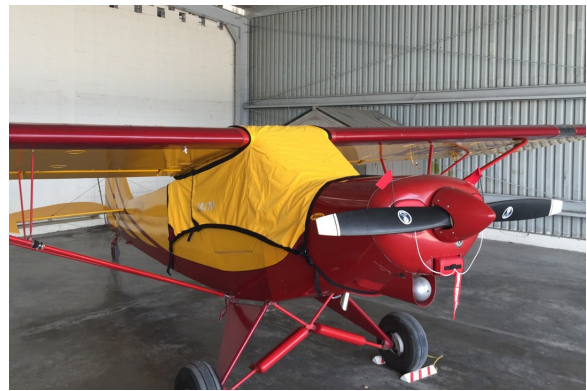
Piper Super Cub Canopy Cover, Engine Plugs