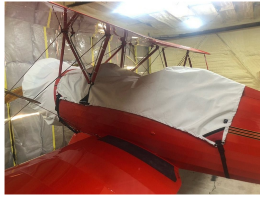
Hatz Biplane CB-1 Canopy Cover & Engine Cover