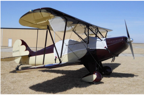
Hatz Biplane Canopy Cover