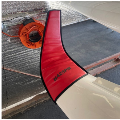
Stemme S-10 & S-12 Wingtip Pads