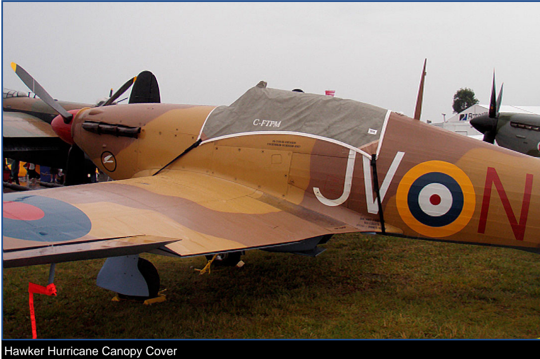
Hawker Hurricane Canopy Cover