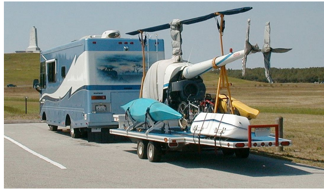
Robinson R-22 Bubble, Rotor Mast, Blades, Tail Rotor & Stabilizer Covers