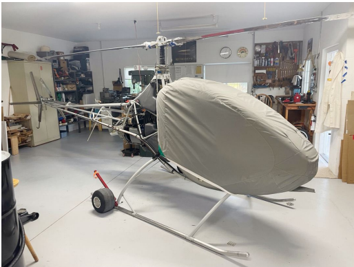
Eagle Helicycle Bubble Cover