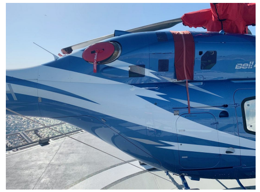
Bell 429 Exhaust Plug, Rotor Mast Cover