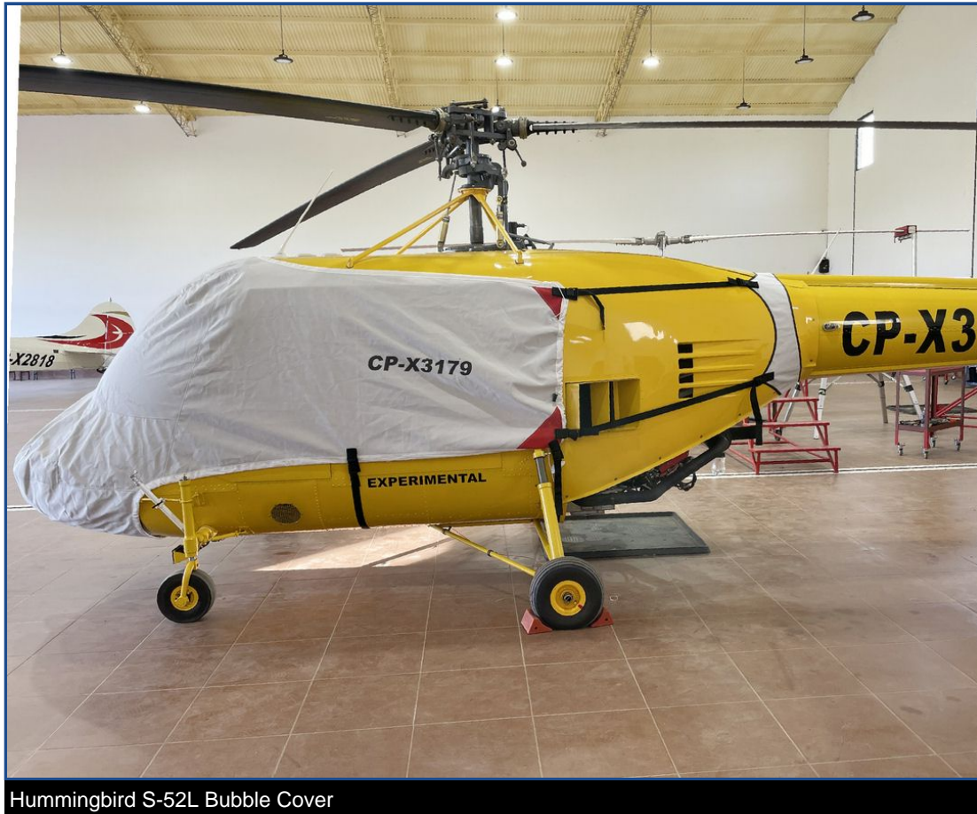
Hummingbird S-52L Bubble Cover