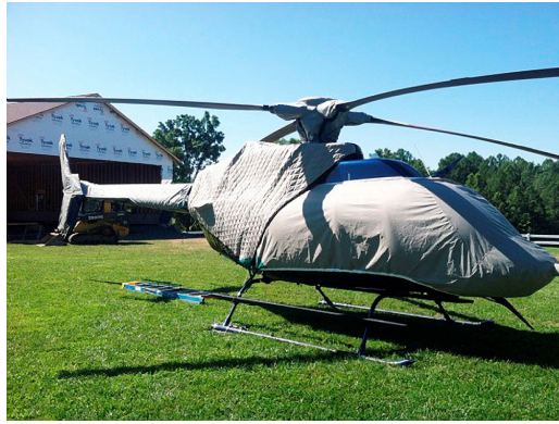
Bell 407 Covers: Bubble, Insulated Engine, Rotor Mast, Blades, Tailboom, Vertical Stabilizer and Tail Rotor

mitigation, or for occasional travel. The material is lighter and more compact, but more susceptible to UV damage and may have a shorter useful life if used continuously outside than the all-year use material.