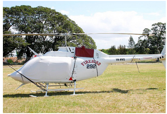
206B Bubble Cover