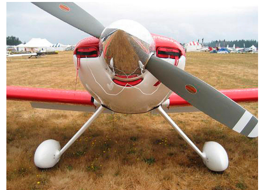
Harmon Rocket Engine Inlet Plugs