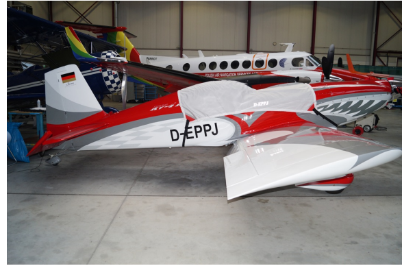
Harmon Rocket III Canopy Cover