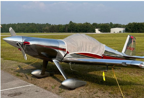
Harmon Rocket Travel Light Weight Canopy Cover Std Windshield

Engine Inlet Plugs are custom fit for your Harmon Rocket intakes, made with heavy-duty vinyl material, and stuffed with a single block of sculpted urethane foam. Each plug has a zipper that allows the foam to be removed and dried if necessary. Engine plugs have warning flags that are visible from the cockpit or 'remove before flight' streamers sewn onto the face of the plugs. Most plugs are imprinted with the aircraft registration number in black for an extra charge. Storage bag NOT included. Engine plugs may be inserted after flight when the engine is still warm. Engine Inlet Plugs are commonly referred to as Cowl Plugs, Intake Plugs, Cowl Blocks, Engine Blocks, and Engine Bungs.