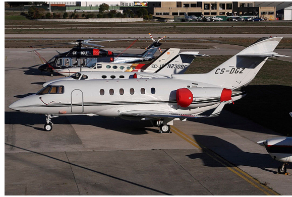
Hawker 900XP Engine Inlet/Exhaust Cover Set & Pitot AOA Cover Set & Cockpit HeatShield Set