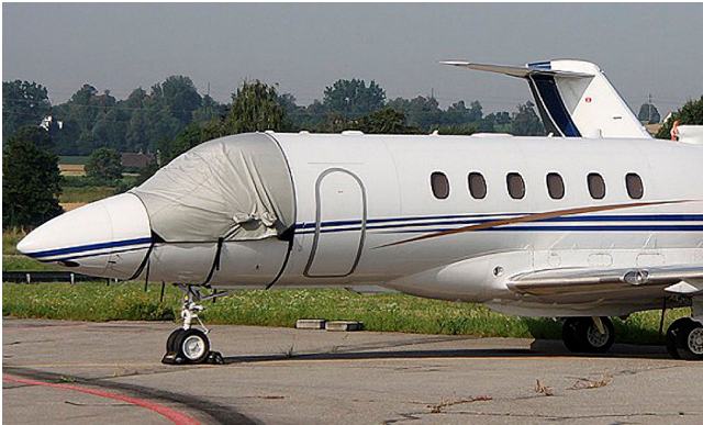
Hawker 800 Cockpit Cover

This cover type is made from Silver Acrylic Sunbrella canvas and is 100% lined with a soft and smooth microfiber. Bruce's Custom Covers developed this material combination especially for aircraft protection. The outer material is medium weight and treated for water resistance, UV resistance and anti-static buildup. The inner lining is a very soft and smooth microfiber to prevent scratching. The material is very reflective, and tests show that the cabin interior temperature can be reduced to near-ambient temperature on the hottest of days. It is water, ice and snow repellent, yet breathable to allow moisture to escape from between the cover and the aircraft surface.