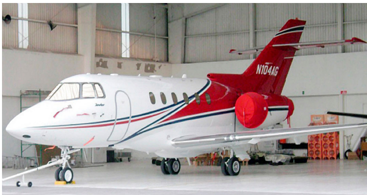
Hawker 900XP Engine Covers, Cockpit HeatShields, and Pitots/AOA Cover set