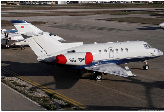
Hawker 900XP Engine Inlet/Exhaust Cover Set & Pitot AOA Cover Set & Cockpit HeatShield Set