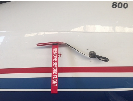
Hawker Beechcraft 800, 800XP, 850XP Pitot Covers With Aoa Straps

The Engine Inlet Plugs are custom fit for your Hawker Beechcraft 900XP intakes, made with heavy-duty vinyl material, and stuffed with a single block of sculpted urethane foam. Each plug has a zipper that allows the foam to be removed and dried if necessary. Engine plugs have 'remove before flight' streamers sewn onto the face of the plugs. Most plugs are imprinted with the aircraft registration number in black for an extra charge. Storage bag NOT included. Engine plugs may be inserted after flight when the engine is still warm. Engine Inlet Plugs are commonly referred to as Cowl Plugs, Intake Plugs, Cowl Blocks, Engine Blocks, and Engine Bungs.