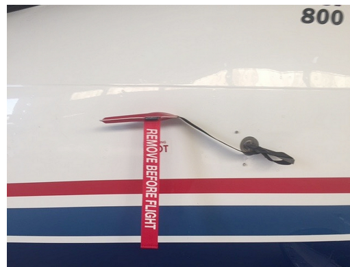
Hawker Beechcraft 800, 800XP, 850XP Pitot Covers With Aoa Straps

The Engine Inlet Plugs are custom fit for your Hawker Beechcraft 900XP intakes, made with heavy-duty vinyl material, and stuffed with a single block of sculpted urethane foam. Each plug has a zipper that allows the foam to be removed and dried if necessary. Engine plugs have 'remove before flight' streamers sewn onto the face of the plugs. Most plugs are imprinted with the aircraft registration number in black for an extra charge. Storage bag NOT included. Engine plugs may be inserted after flight when the engine is still warm. Engine Inlet Plugs are commonly referred to as Cowl Plugs, Intake Plugs, Cowl Blocks, Engine Blocks, and Engine Bungs.