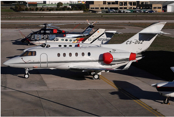
Hawker 900XP Engine Inlet/Exhaust Cover Set & Pitot AOA Cover Set & Cockpit HeatShield Set