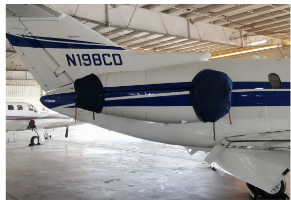
Hawker 750 Engine Covers