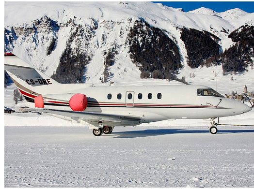
Hawker 800 Tri-Fold Engine Covers & Pitot Covers