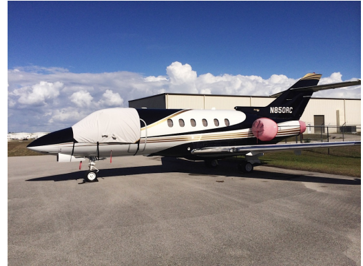
Hawker 800 Cockpit Cover, extended aft 24"