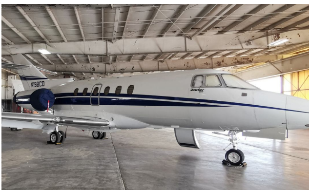
Hawker 750 HeatShields & Engine Covers

Cockpit Heatshields are interior sunshades for the aircraft's cockpit. The product is a unique composite of closed-cell foam with a silver mylar finish. The semi-rigid design is stiff enough to stand inside the window framing. The set folds up flat and is easily stored in the included storage sleeve. Some designs may require velcro and suction cups. Our Heatshields for jets are offered white side out because some aircraft manufacturers have issued advisories against reflective window inserts due to potential heat damage. A Heatshield is an excellent short-term remedy for cockpit overheating, but an external fabric cover is more effective for long-term protection.