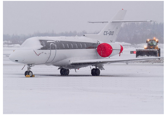
Hawker 750 Engine Cover set