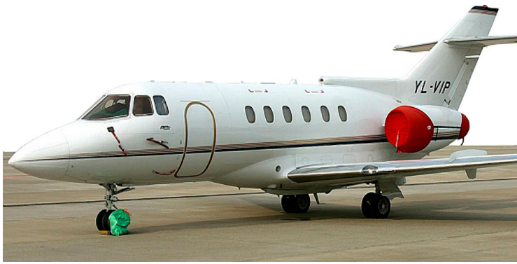
Hawker 700 Tri-Fold Engine Covers