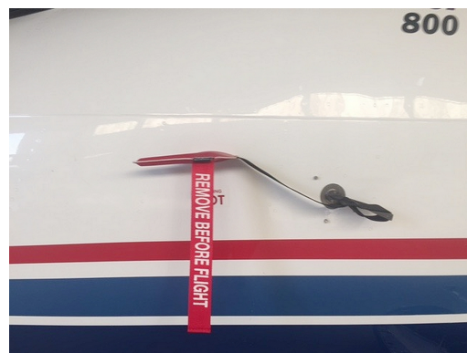
Hawker Beechcraft 800, 800XP, 850XP Pitot Covers With Aoa Straps

The Engine Inlet Plugs are custom fit for your British Aerospace Hawker 700 intakes, made with heavy-duty vinyl material, and stuffed with a single block of sculpted urethane foam. Each plug has a zipper that allows the foam to be removed and dried if necessary. Engine plugs have 'remove before flight' streamers sewn onto the face of the plugs. Most plugs are imprinted with the aircraft registration number in black for an extra charge. Storage bag NOT included. Engine plugs may be inserted after flight when the engine is still warm. Engine Inlet Plugs are commonly referred to as Cowl Plugs, Intake Plugs, Cowl Blocks, Engine Blocks, and Engine Bunges.