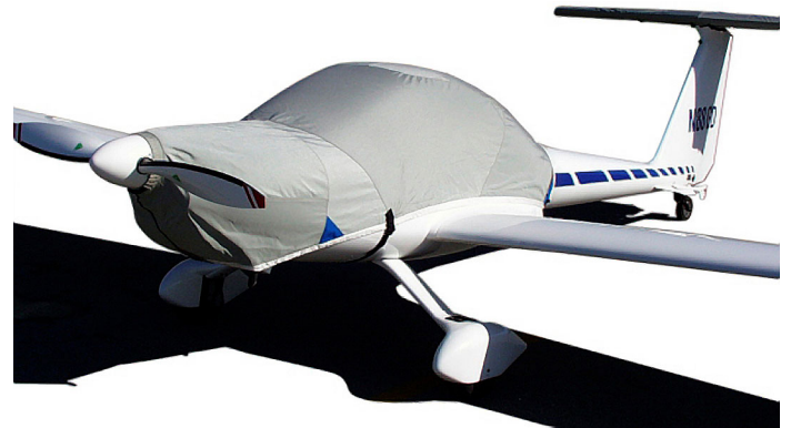
Diamond DA-20 Canopy/Engine Cover