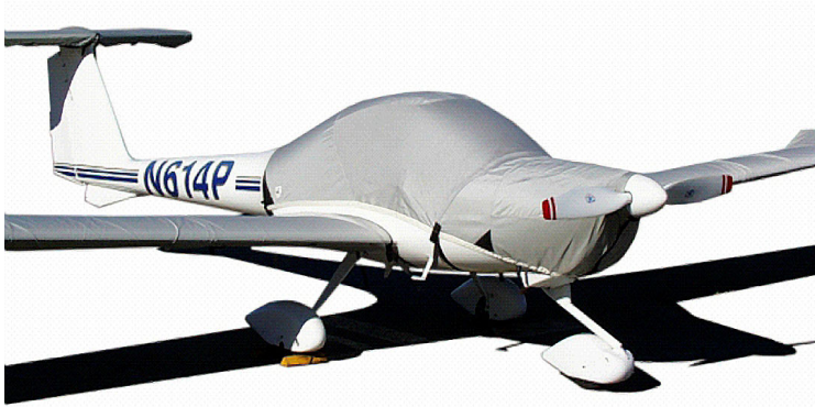
Diamond DA-20 Canopy/Engine, Wing & Horiz. Stab. Covers

The Dimona H36 Canopy/Engine Cover is a one-piece cover (100% lined with microfiber) that is a combination of the Canopy Cover and Engine Cover. This cover will enclose the engine cowl and will extend aft to cover all of the windows. This cover type is made from Silver Acrylic Sunbrella canvas and is 100% lined with a soft and smooth microfiber. Bruce's Custom Covers developed this material combination especially for aircraft protection. The outer material is medium weight and treated for water resistance, UV resistance and anti-static buildup. The inner lining is a very soft and smooth microfiber to prevent scratching. The material is very reflective, and tests show that the cabin interior temperature can be reduced to near-ambient temperature on the hottest of days. It is water, ice and snow repellent, yet breathable to allow moisture to escape from between the cover and the aircraft surface.