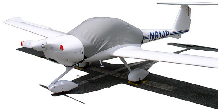
Diamond DA-20 Canopy Cover