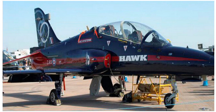
Covers, Plugs, HeatShields and related items for the British Aerospace Hawk 108