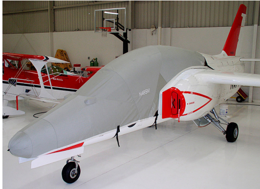
S-211 Canopy/Nose Cover & Engine Plugs

This cover type is made from Silver Acrylic Sunbrella canvas and is 100% lined with a soft and smooth microfiber. Bruce's Custom Covers developed this material combination especially for aircraft protection. The outer material is medium weight and treated for water resistance, UV resistance and anti-static buildup. The inner lining is a very soft and smooth microfiber to prevent scratching. The material is very reflective, and tests show that the cabin interior temperature can be reduced to near-ambient temperature on the hottest of days. It is water, ice and snow repellent, yet breathable to allow moisture to escape from between the cover and the aircraft surface.