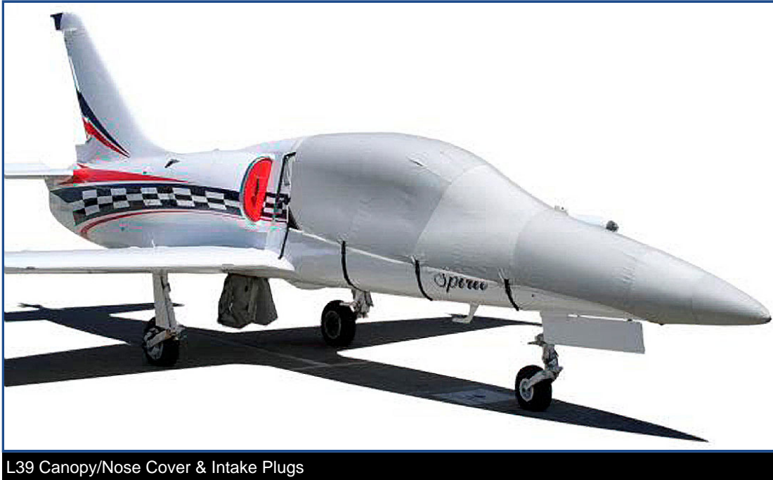
L39 Canopy/Nose Cover &amp; Intake Plugs