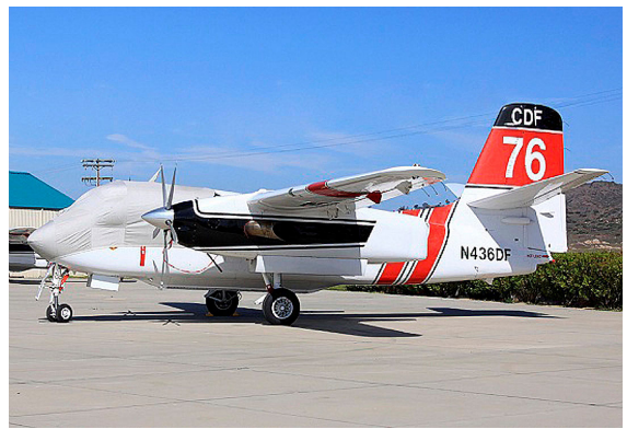
Grumman Tracker (turbine model) Canopy/Nose Cover