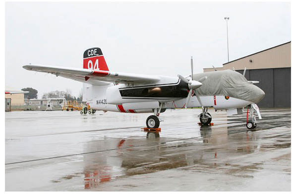
Grumman Tracker Canopy/Nose & Engine Covers