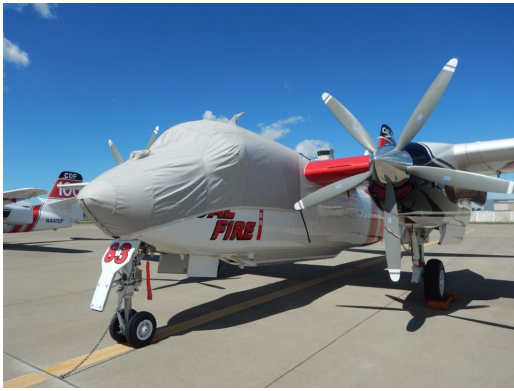
Grumman Tracker Canopy/Nose Cover