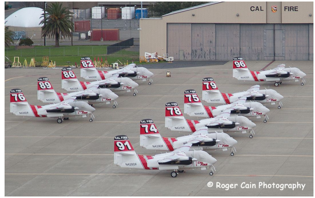
Grumman S-2 Tracker Canopy/Nose Cover