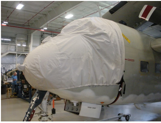
Grumman Tracker Canopy/Nose Cover