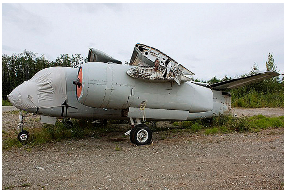
Grumman Tracker Canopy/Nose Cover