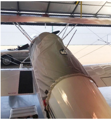
Great Lakes Sport Biplane Canopy Cover, Travel Weight

This cover type is made from Silver Acrylic Sunbrella canvas and is 100% lined with a soft and smooth microfiber. Bruce's Custom Covers developed this material combination especially for aircraft protection. The outer material is medium weight and treated for water resistance, UV resistance and anti-static buildup. The inner lining is a very soft and smooth microfiber to prevent scratching. The material is very reflective, and tests show that the cabin interior temperature can be reduced to near-ambient temperature on the hottest of days. It is water, ice and snow repellent, yet breathable to allow moisture to escape from between the cover and the aircraft surface.