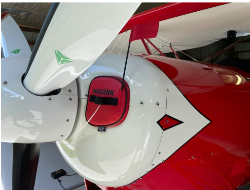
Great Lakes Engine Plugs

Engine Inlet Plugs are custom fit for your Great Lakes Sport Biplane intakes, made with heavy-duty vinyl material, and stuffed with a single block of sculpted urethane foam. Each plug has a zipper that allows the foam to be removed and dried if necessary. Engine plugs have warning flags that are visible from the cockpit or 'remove before flight' streamers sewn onto the face of the plugs. Most plugs are imprinted with the aircraft registration number in black for an extra charge. Storage bag NOT included. Engine plugs may be inserted after flight when the engine is still warm. Engine Inlet Plugs are commonly referred to as Cowl Plugs, Intake Plugs, Cowl Blocks, Engine Blocks, and Engine Bungs.