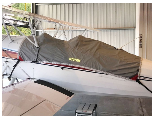
Great Lakes Sport Biplane Canopy Cover, Travel Weight