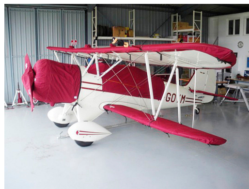
Travel Air 4000 Canopy and Engine Covers, light weight travel type Waco UPF-7 Canopy, Wings, Stab's, Engine, Prop Covers