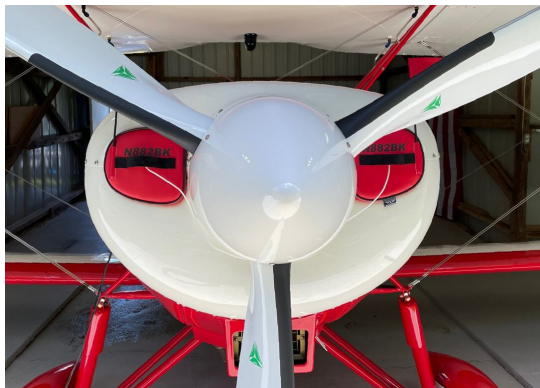
Great Lakes Engine Plugs

Engine Inlet Plugs are custom fit for your Great Lakes Sport Biplane intakes, made with heavy-duty vinyl material, and stuffed with a single block of sculpted urethane foam. Each plug has a zipper that allows the foam to be removed and dried if necessary. Engine plugs have warning flags that are visible from the cockpit or 'remove before flight' streamers sewn onto the face of the plugs. Most plugs are imprinted with the aircraft registration number in black for an extra charge. Storage bag NOT included. Engine plugs may be inserted after flight when the engine is still warm. Engine Inlet Plugs are commonly referred to as Cowl Plugs, Intake Plugs, Cowl Blocks, Engine Blocks, and Engine Bungs.