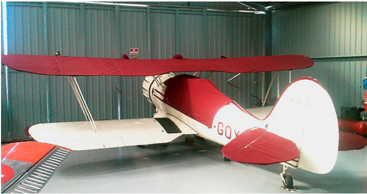
Waco UPF-7 Upper/Lower Wing Cover, Horizontal Stabilizer Cover, & Canopy Cover