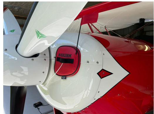
Great Lakes Engine Plugs