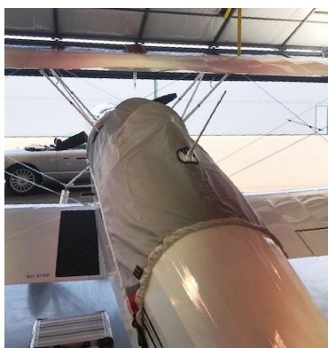
Great Lakes Sport Biplane Canopy Cover, Travel Weight

This cover type is made from Silver Acrylic Sunbrella canvas and is 100% lined with a soft and smooth microfiber. Bruce's Custom Covers developed this material combination especially for aircraft protection. The outer material is medium weight and treated for water resistance, UV resistance and anti-static buildup. The inner lining is a very soft and smooth microfiber to prevent scratching. The material is very reflective, and tests show that the cabin interior temperature can be reduced to near-ambient temperature on the hottest of days. It is water, ice and snow repellent, yet breathable to allow moisture to escape from between the cover and the aircraft surface.