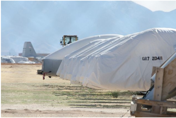
GR-7/9 FULL FUSELAGE COVER , NSN's: 1730-01-600-4557 & 1730-01-600-6757, single seat

This cover type is made from Silver Acrylic Sunbrella canvas and is 100% lined with a soft and smooth microfiber. Bruce's Custom Covers developed this material combination especially for aircraft protection. The outer material is medium weight and treated for water resistance, UV resistance and anti-static buildup. The inner lining is a very soft and smooth microfiber to prevent scratching. The material is very reflective, and tests show that the cabin interior temperature can be reduced to near-ambient temperature on the hottest of days. It is water, ice and snow repellent, yet breathable to allow moisture to escape from between the cover and the aircraft surface.