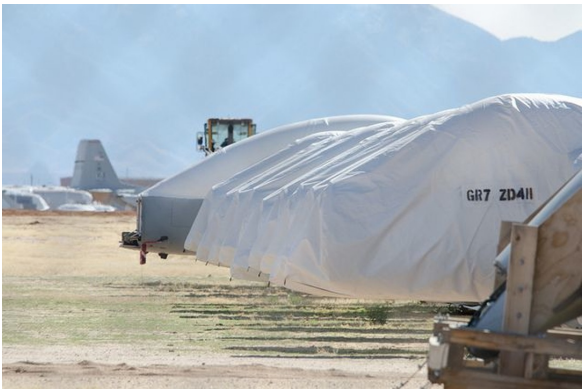
GR-7/9 FULL FUSELAGE COVER , NSN's: 1730-01-600-4557 & GR-7/9 FULL FUSELAGE COVER , NSN's: 1730-01-600-4557 & 1730-01-600-6757, single seat GR-7/9 FULL FUSELAGE COVER , NSN's: 1730-01-600-4557 & 1730-01-600-6757, single seat