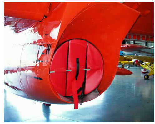
Exhaust Plug, folding type