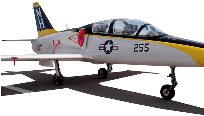
L-39 Intake Plugs