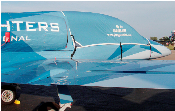
L-39 Canopy Cover & Plugs

Covers developed this material combination especially for aircraft protection. The outer material is medium weight and treated for water resistance, UV resistance and anti-static buildup. The inner lining is a very soft and smooth microfiber to prevent scratching. The material is very reflective, and tests show that the cabin interior temperature can be reduced to near-ambient temperature on the hottest of days. It is water, ice and snow repellent, yet breathable to allow moisture to escape from between the cover and the aircraft surface.