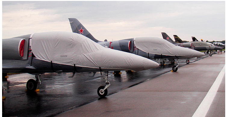
L-39 Canopy/Nose Covers & Plugs