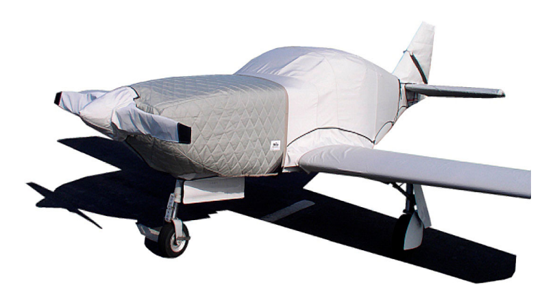
Glasair I Insulated Engine Cover, Prop Cover, Etc.