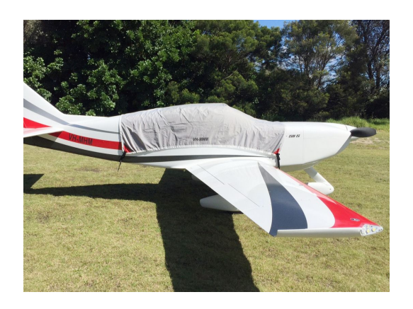
Glasair II Canopy Cover