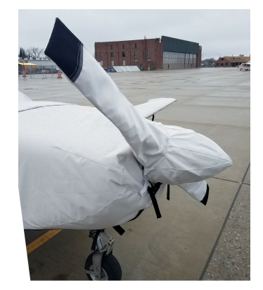
Glasair I Insulated Engine Cover, Prop Cover, Etc.