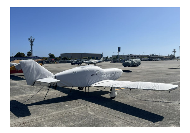
Glasair II Complete Cover Set

This cover type is made from Silver Acrylic Sunbrella canvas and is 100% lined with a soft and smooth microfiber. Bruce's Custom Covers developed this material combination especially for aircraft protection. The outer material is medium weight and treated for water resistance, UV resistance and anti-static buildup. The inner lining is a very soft and smooth microfiber to prevent scratching. The material is very reflective, and tests show that the cabin interior temperature can be reduced to near-ambient temperature on the hottest of days. It is water, ice and snow repellent, yet breathable to allow moisture to escape from between the cover and the aircraft surface.