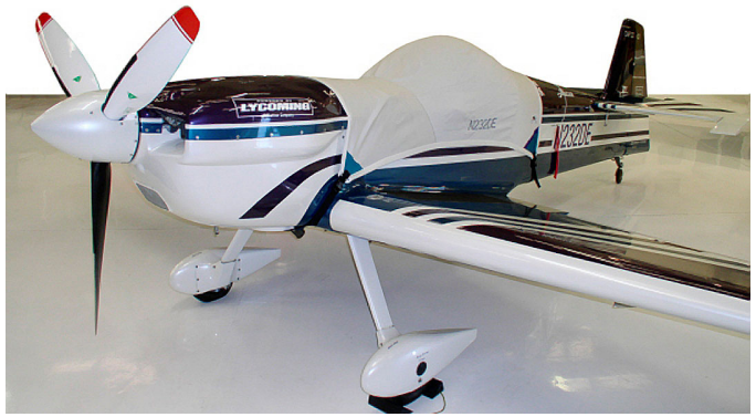
Cap 232 Canopy Cover