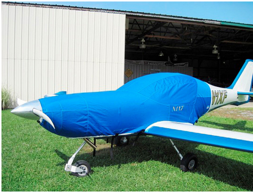
Arion Lightning Extended Canopy/Engine Cover