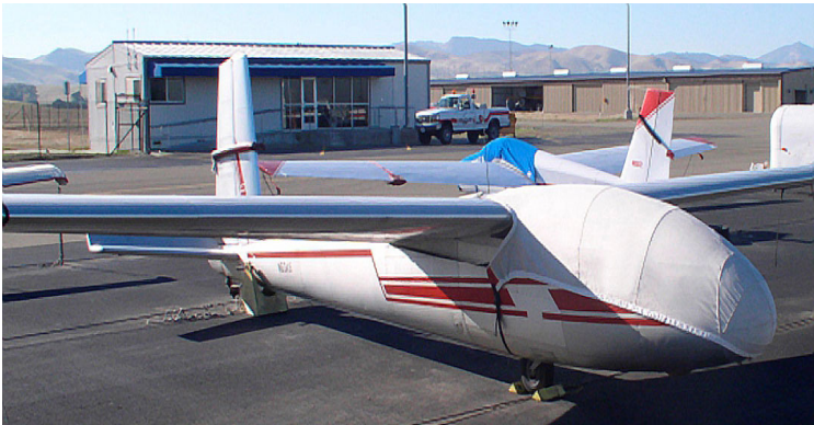
Blanik L13 Canopy/Nose Cover