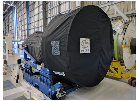
GE CF-6 Off-Link Engine Cover