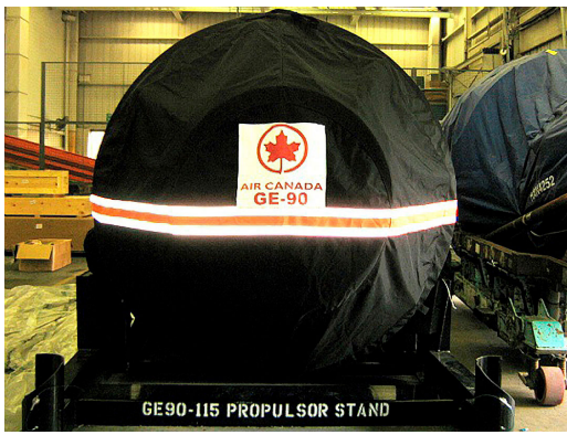
GE90-115 Propulsor QEC Engine Long-term Storage/Transport Cover "Bag" Boeing 777