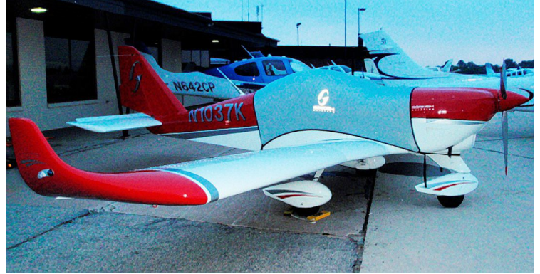
Gobosh Light Weight Travel-Cover